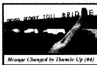
Message Changed by Thumbs-Up (#4)

Things you won't ever need to see (Page 68)