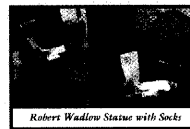
Roberts Wadlow Statue with Socks