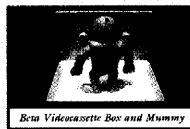
Beta Videocassette Box and Mummy