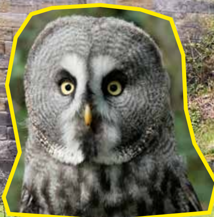
Great Grey Owl