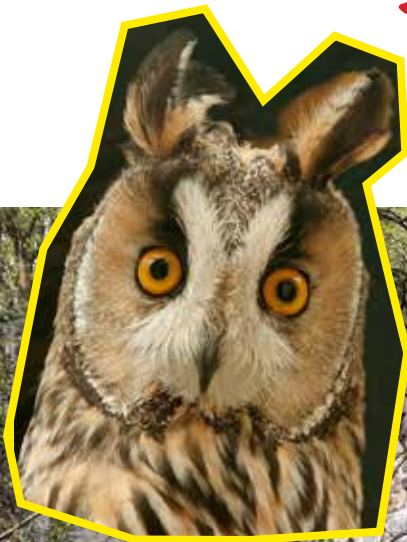
Long Eared Owl