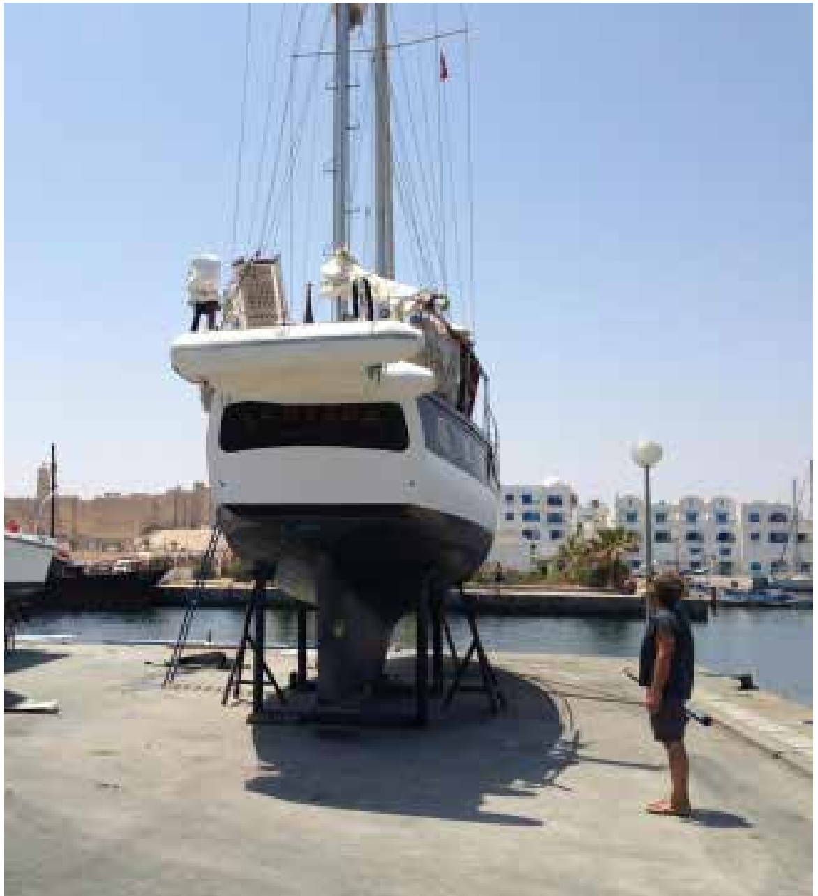
New antifouling 2013