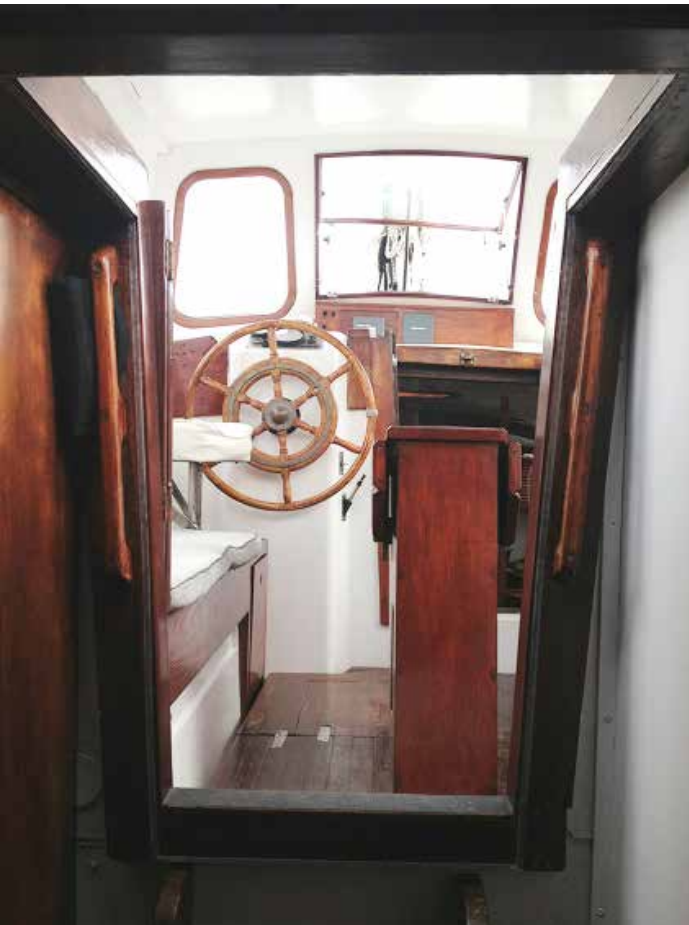
Companion way aft