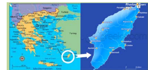
Map of Greece