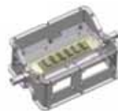
Power Electronics Cooling

Some samples of the numerous products in our extensive HEV/EV portfolio.