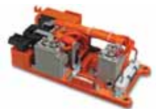
High Voltage Electrical Centers