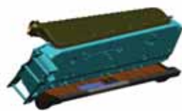
Battery Cooling - Air