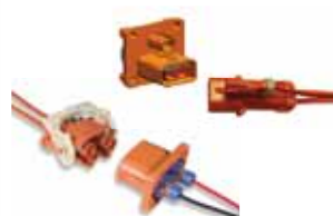
Shielded Connections 0-40 Amps