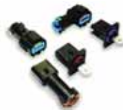
Un-Shielded Connections 40-250 Amps