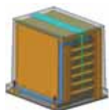
Battery Cooling - Liquid