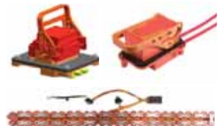
High Voltage Battery Systems