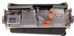
High Voltage Battery Pack