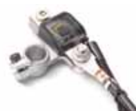
Battery Monitoring Devices