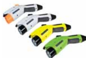
Charge Port Coupler