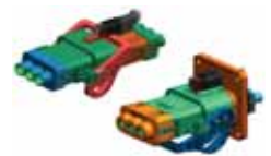
Shielded Connections 40-145 Amps