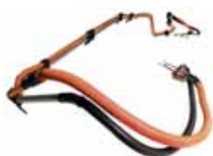
High Voltage/Shielded Wiring Asm. & Cables