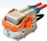
Shielded Connections 145-250 Amps