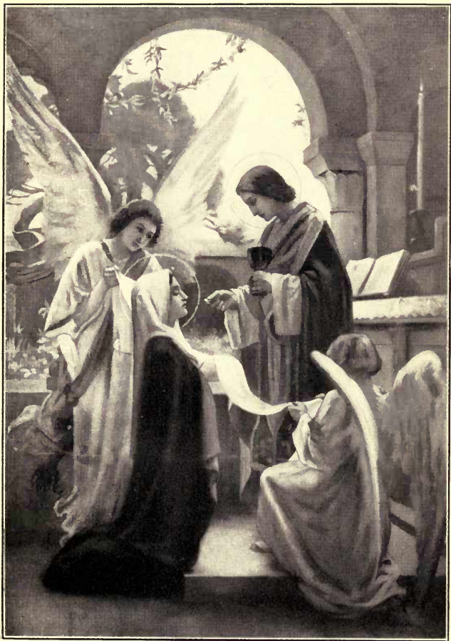
The Blessed Virgin receives Holy Communion at the hands of St. John.