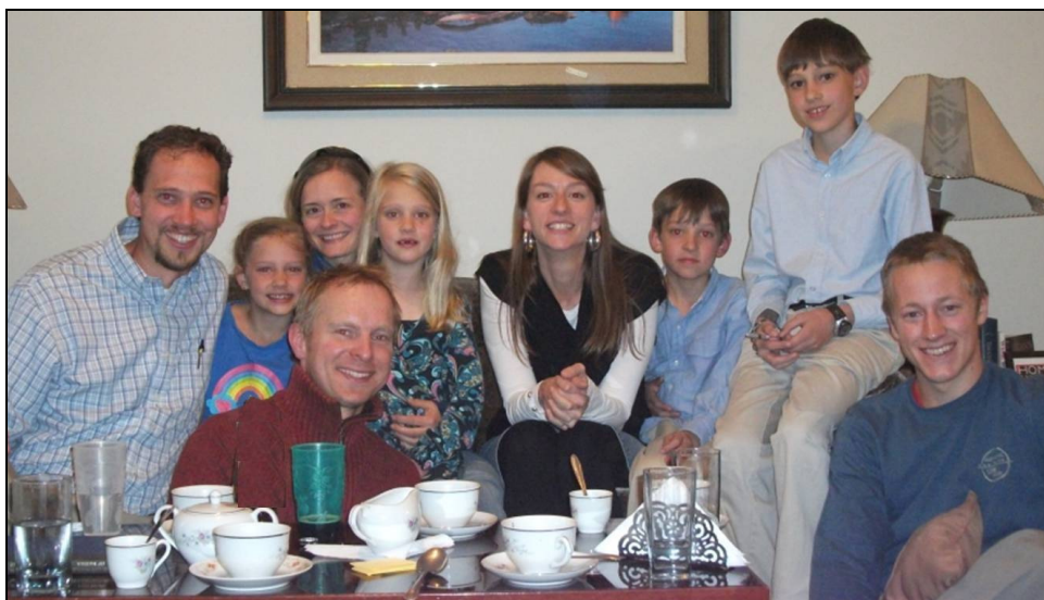
Enjoying a Lord's Day afternoon with language school friends from Germany and Switzerland!

Another source of great encouragement at the language school is the assortment of missionaries who come through the school from all over the globe. Norwegians, Australians, Swiss, Germans, English, Americans, and Irish are all currently represented. We have made some wonderful friendships and have been greatly gladdened to become acquainted with these earnest, zealous Christians. It is especially encouraging to see those from Europe, of which we hear so much about spiritual dryness.