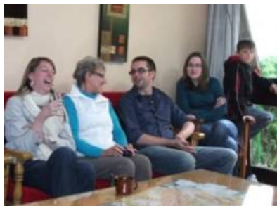
Enjoying a break at school w/ some Brits!