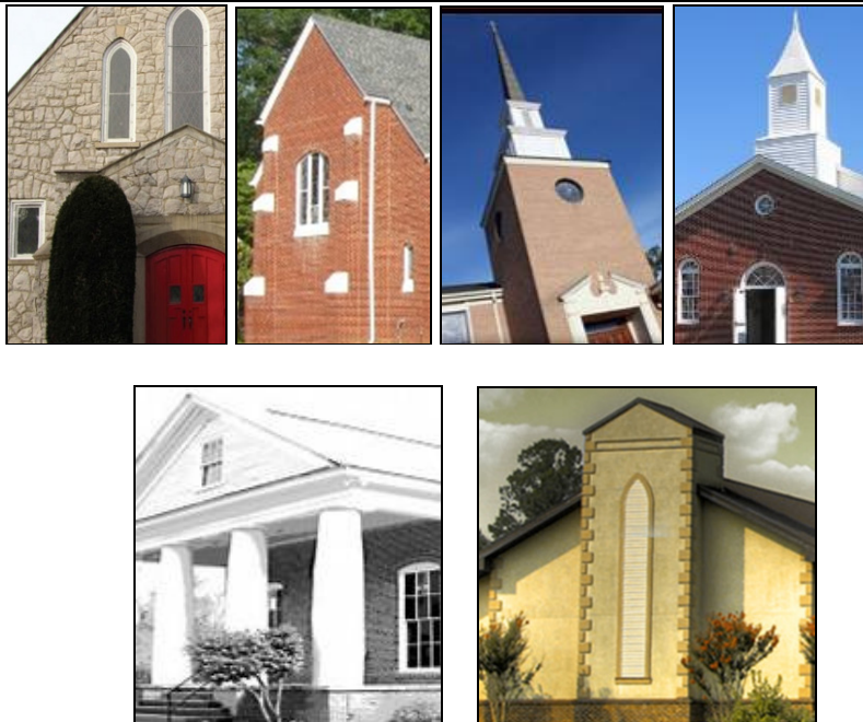
A few of the churches we've visited