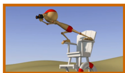
Shot 2: LIFEGUARD : (Animation Mentor, 2011) Class 4 - Mentor: David Weatherly