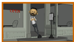
Shot 4: WAITER : (Animation Mentor, 2011) Class 3 - Mentor: Drew Adams