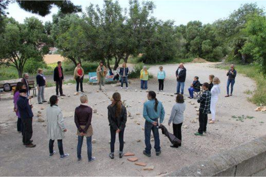
San Martin de Los Andes/Lago Puelo Argentina