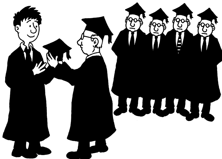
Fig. 1. “Congratulations, you are now capable of writing technical, impersonal and boring papers like myself and the other gentlemen – welcome to Academia”.

If an author really wants to make sure that the reader loses interest, I recommend that he/she does not introduce the ideas and main findings straightaway, but instead hide them at the end of a lengthy narrative. The technique can be refined by putting the same emphasis on what is unimportant or marginally important as on what is really important to make certain that the writing creates the proper hypnotic effect which will put the reader to sleep.