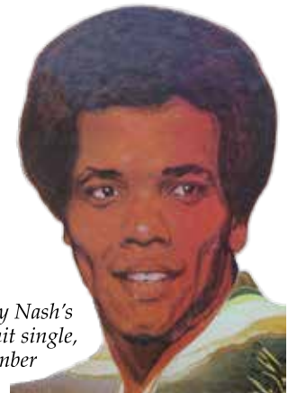
Johnny Nash's biggest hit single, reaching number 1 in 1972.