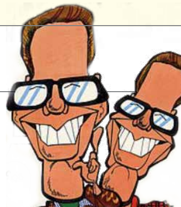
A huge hit for the Leith-born duo The Proclaimers in 1988, 1993 and 2007.