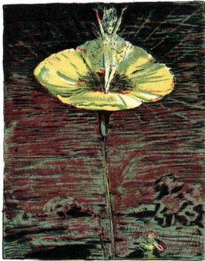
The Fairy Flower

"Little Rabbit," she said, "don't you know who I am?"