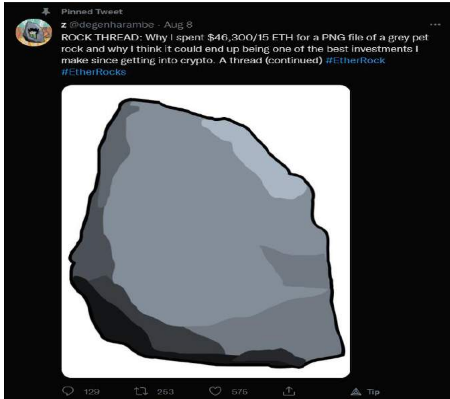
Figure 2; twitter, @degenharambe

Source: https://twitter.com/degenharambe/status/1424133878352998401?s=20