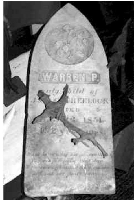
A headstone used as a satanic altar as seen in the Occult Museum.

So, if we can prove in a court of law that ghosts exist and haunted houses exist I think that's good enough for anyone.