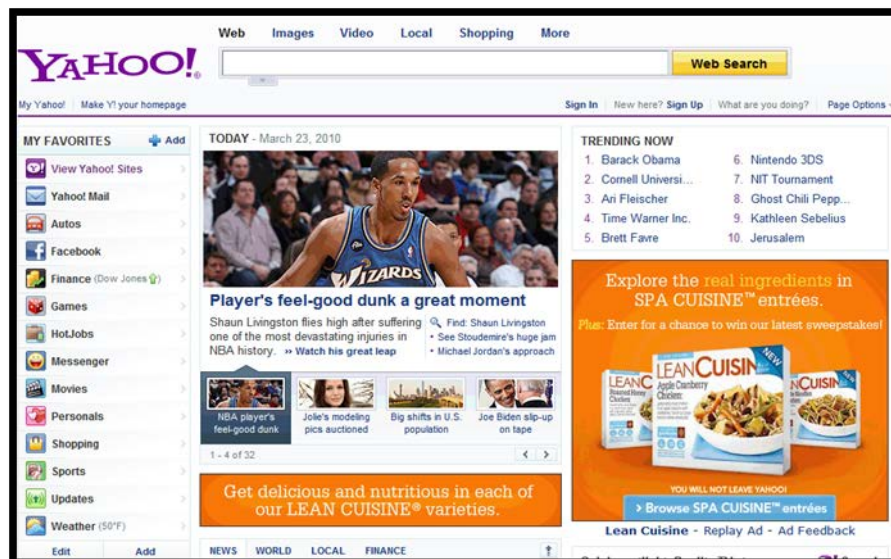
Figure 2.1.14: An Example of Digital Media Advertising

Any advertisement which appears via the Internet or online is known as digital media advertising. Digital advertising has evolved rapidly in the last 15 years and market leaders have realised the importance and the complexity it poses.