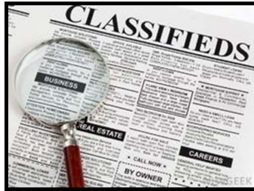
Figure 2.1.2: An Example of Classified Advertising

as they are charged based on per line. These are not widespread as large display ads. They do not include any graphics.