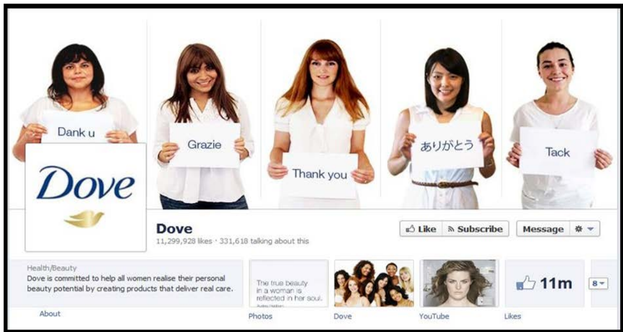
Figure 2.1.20: An Example of Global Advertising

The example from Dove campaigns depict that despite cultural differences, the ladies all over the world thank Dove for taking care of their hair and skin health.