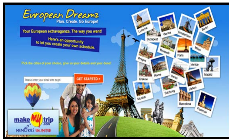
Figure 2.1.8: An Example of Periodical Advertising

Companies always attempted to grab the centre spread, front or the back cover of any popular magazine or newspaper.