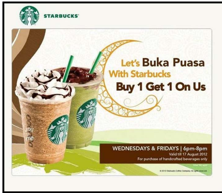
Figure 2.1.7: An Example of Direct Response Advertising