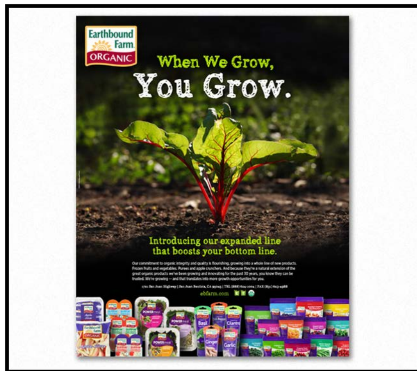
Figure 2.1.15: An Example of Trade Advertising

Trade advertising is carried out by a producer, directed towards the wholesalers, distributors and traders rather than the end consumer of the product. Trade advertising is strategically important as it establishes good relations with the traders, wholesalers and distributors associated with the selling of a company's brands. The advantage of trade advertising is that it is cost-effective and provides a better means to communicate with the target audience. Trade advertisements create an image in the trader's mind, which eventually compels him/her to approach the company to sell its product. These advertisements are specially done in specific mediums and journals.