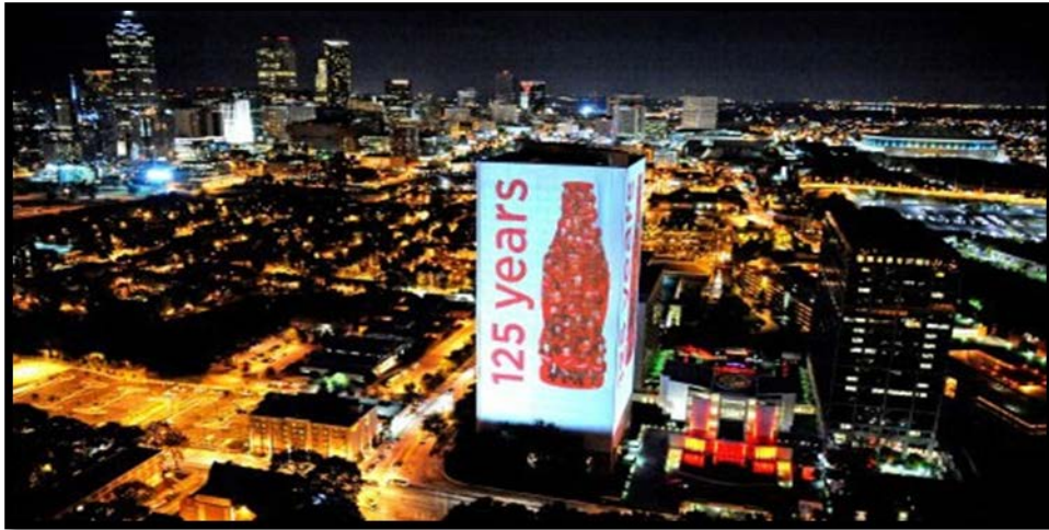
Figure 2.1.1: Coca-Cola's Campaign for completing 125 Years of Success

The above snippet highlights how Coca-Cola used an Integrated Marketing Communication Campaign to say “Thank You” to their consumers for the magnificent 125 years of success.