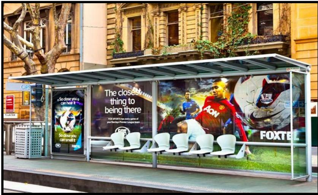
Figure 2.1.13: An Example of Outdoor Media Advertising