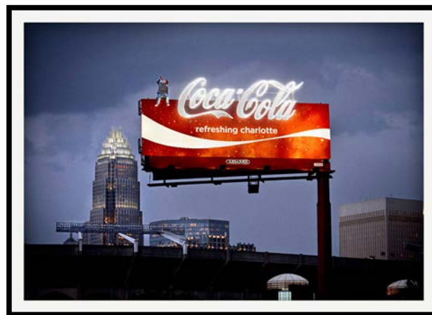
Figure 2.1.12: An Example of Outdoor Media Advertising

Outdoor media advertising refers to billboards, bus shelter posters, fly posters, digital posters etc. This type of advertising is also known as out-of-home advertising as these ads reach out to consumers when they are outside home.