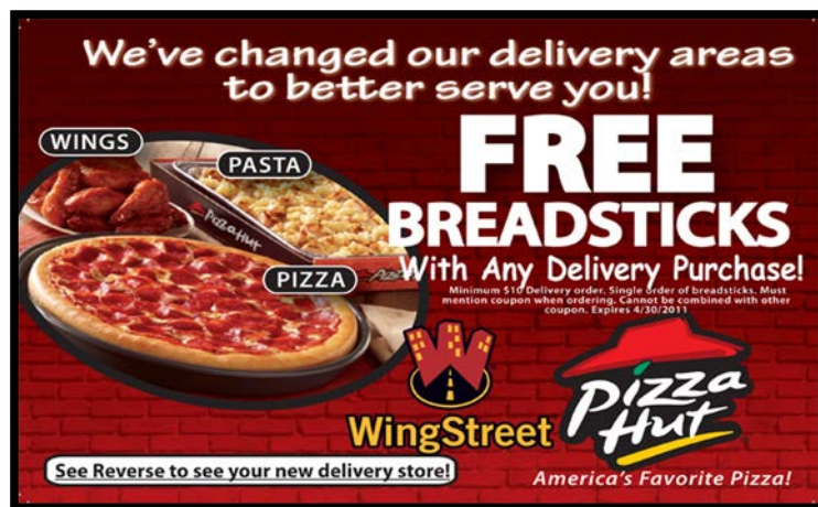
Figure 2.1.10: An Example of Direct Mail Advertising