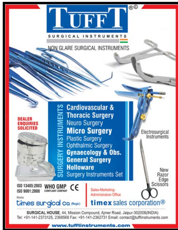
Figure 2.1.16: An Example of Professional Advertising