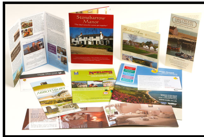
Figure 2.1.9: An Example of Brochure and Leaflet Advertising