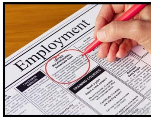
Figure 2.1.3: Another Example of Classified Advertising