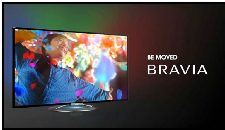
Figure 2.1.11: An Example of Broadcast Media Advertising