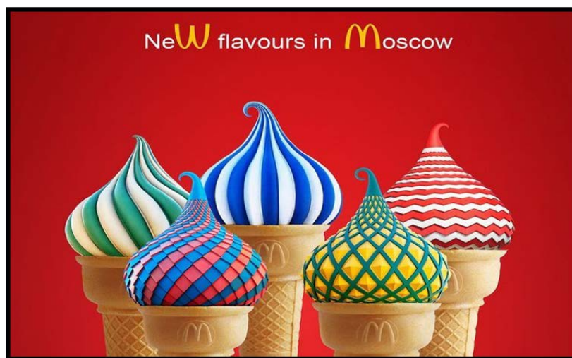
Figure 2.1.18: An Example of National Advertising

National advertisements are broadcasted on televisions, radios, newspapers, magazines, billboards and the Internet. National advertising is an expensive affair; therefore, it is carried out by large and well-funded companies such as Coke, Pepsi, Procter & Gamble, Johnson & Johnson etc. The companies intending for national advertisements identify a specific target audience and then build a brand image. Companies sometimes introduce new brands and emphasise on brand loyalty for the established ones through national advertising. The following advertisements highlights the new flavours of ice-cream introduced by Mc Donald's in Moscow.