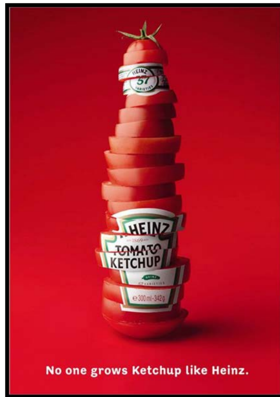
Figure 2.1.6: An Example of End Product Advertising