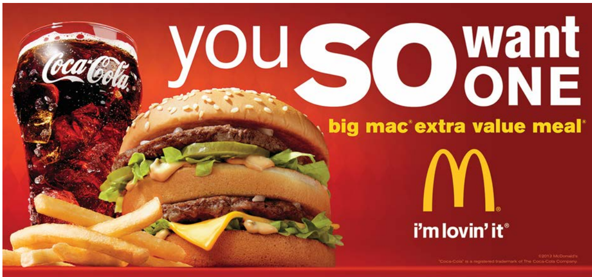
Figure 2.1.5: An Example of Co-operative Advertising

operative advertising, sharing the cost of advertisement for their mutual benefit is a common practice.