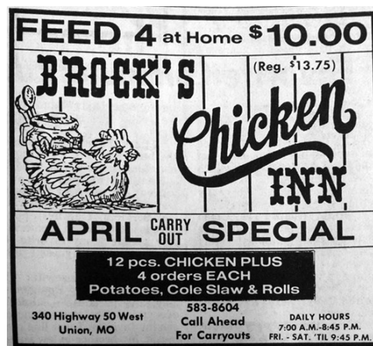
Figure 2.1.19: An Example of Local Advertising

Local advertising is actually about knowing and interacting with neighbours and people in the vicinity. It is more about developing relationships than investing money. This requires small businesses to actually move out from their offices and interact with prospective consumers.