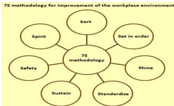
Fig. 2. 7S methodology for improvement of the work place environment

‘Seven S’ (7S) methodology is adopted in some of the organizations for the improvement of the workplace environment (Fig 2). This is carried out by eliminating or reducing the waste, inconsistency, and physical strain. The implementation of 7S methodology consists of seven phases namely (i) sort, (ii) set in order, (iii) shine, (iv) standardize, (v) sustain or self-discipline, (vi) safety, and (vii) spirit or team spirit. Each phase of 7S methodology continuously improves the performance of the organization by eliminating wastages of searching, waiting, transportation, motion, and work in progress inventory etc. The 7S methodology makes the working environment clean and safe which improves the morale of the employees and hence has a positive effect on their performance. The improvement is in the quantitative form as well as in the qualitative form. The quantifiable variables are searching, movement, and waiting time, cycle time, lead time, production rate, productivity, and quality etc. while the qualitative variables are working environment, communication, and morale etc.