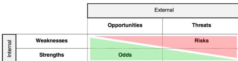
Figure 3. Odds-Risks-Matrix

The biggest benefit of SWOT analyses is that it focuses on both the inside and outside environment. It complements this thesis by providing a closer look at the provided solution and the company itself. The main advantages are identified in the method, but also some weak sides are discussed. This will help the company looking for expansion to focus on its strengths and manage its the weaknesses. The threats can be from different origins. In the method they are considered as barriers. The opportunities also take a part in the method. SWOT analysis requires no extensive training or technical skills to be used successfully and specialized training and skills are not necessary, the use of SWOT analysis can actually reduce the costs associated with strategic planning(Koseva, 2012; Karg, Jahn, Ahrberg, 2014). SWOT analysis assumes a central position in business management. The external (environmental analysis) and internal (analysis of the company) analyzes are always seen in a mutual dependency relationship. This dependence expresses in the “Odds-Risks-Matrix” in which the SWOT analysis typically leads (Figure 3.)( Karg, Jahn, Ahrberg, 2014).