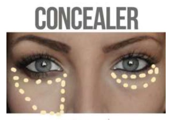
THIS WORKS better than THIS

the concealer and blend it in. Use a green concealer for best results. Yes, you heard me correctly. Green concealer is an actual thing, and it works wonders. Green cancels out red, so when you use a green concealer, your zits are hidden much more so than if you opt for regular concealer. When concealing underneath your eyes to hide dark circles, be sure to