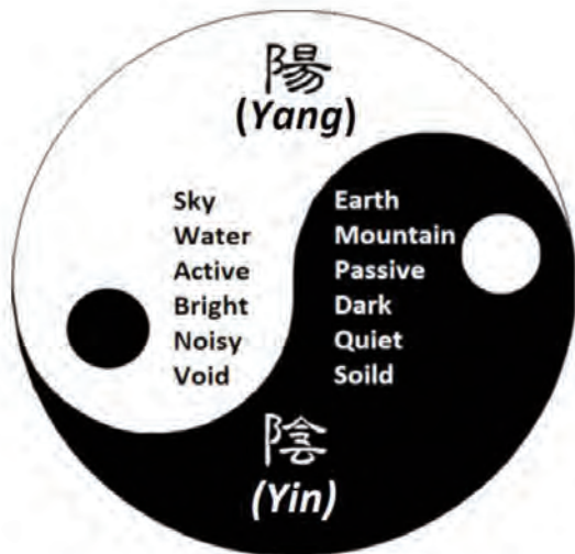
Figure 1. The harmony between yin and yang.

Shui rules are somehow unreasonable. Most of the Chinese do not admit that they practise Feng Shui based on superstition but in fact humankind just needs a way to sustain healthily. According to Xu (1998), treating anything that is partly understood as superstition is not a scientific manner of finding truth. Feng Shui may have supportive values for physical and mental well-being in a practical way rather than strictly superstition. Teather & Chow (2000) highlighted that Feng Shui is connected to human well-being by its visual-psychological implications. It induces environmental planning in accordance with human subjective feelings about, especially essential in a sleep environment.