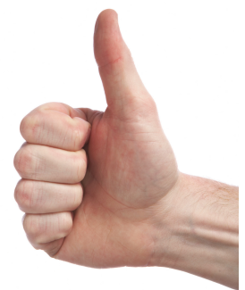
Emblems are gestures that have a specific meaning. In the United