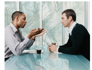
About 65 percent of the meaning we derive during interactions comes from nonverbal communication.

There are some instances in which we verbally communicate involuntarily. These types of exclamations are often verbal responses to a surprising stimulus. For example, we say “owww!” when we stub our toe or scream “stop!” when we see someone heading toward danger. Involuntary nonverbal signals are much more common, and although most nonverbal communication isn’t completely involuntary, it is more below our consciousness than verbal communication and therefore more difficult to control.