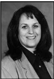
HEIDI J. HORNİK

Note the position of the cross in the two paintings; both are exceptional for their respective styles. Monaco's work is well known as an early presentation of the cross as if it were three-dimensional, sculptural, and emerging out of the picture. Terbrugghen achieves this same effect, for artistic perspective and modeling for three-dimensionality had been developed during the time between the two works. Instead of using the characteristic diagonal of the Baroque style, Terbrugghen maintains a more traditional Renaissance composition to further emphasize the presence of Jesus' mother Mary and devoted friend John the Beloved. The result, in both cases, is a balanced, harmonious, and symmetrical composition. In keeping with the visual tradition, both artists give Mary prominence by placing her on Christ's right side while they place the figure of John on his left.