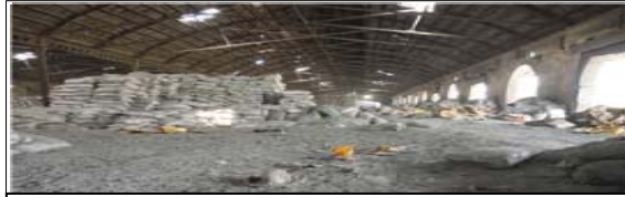
Cement dust at Salt Cotaurs Goods shed, Chennai

construction of boundary walls. It was, however, observed that the remedial measures are yet to be implemented (August 2012).