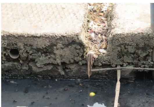
Discharge of waste water from Kharagpur Station (SER)

In SECR, petroleum products were found deposited alongside the track. These were deposited during unloading at the POL Siding at Bhilai. Oil spillages were also noticed during loading activities at GR siding, Bajwa (WR). It was noticed that there were no specific instructions from the RB regarding treatment of oil spillages at sidings. In WR, it was observed that the spilled oil along with other wastes was being treated through the effluent treatment plant.