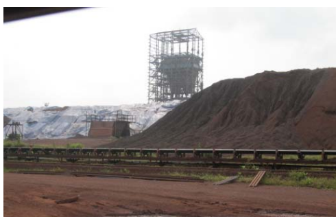
Iron ore partially covered at Noamundi (TISCO) siding in Jharkhand, SER

not covered with tarpaulin when not in use. The siding authority also failed to comply with instructions of JSPCB for construction of boundary wall, drainage, plantation and water sprinkling. Besides, CFO granted by the JSPCB expired in June 2011 and the