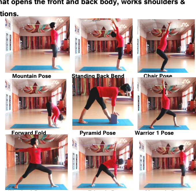
Warrior 2 Pose