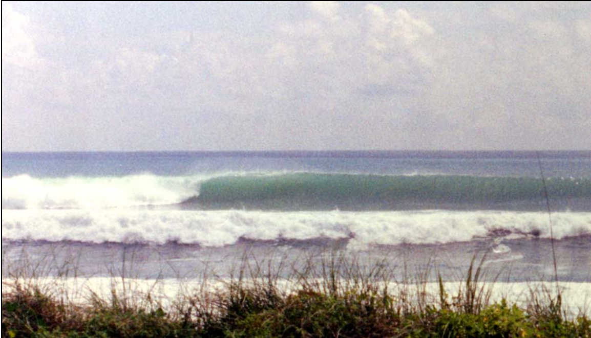
Figure 7. Delray Beach, Florida during Hurricane Floyd in 1999 (Photo: Byran Boruff).