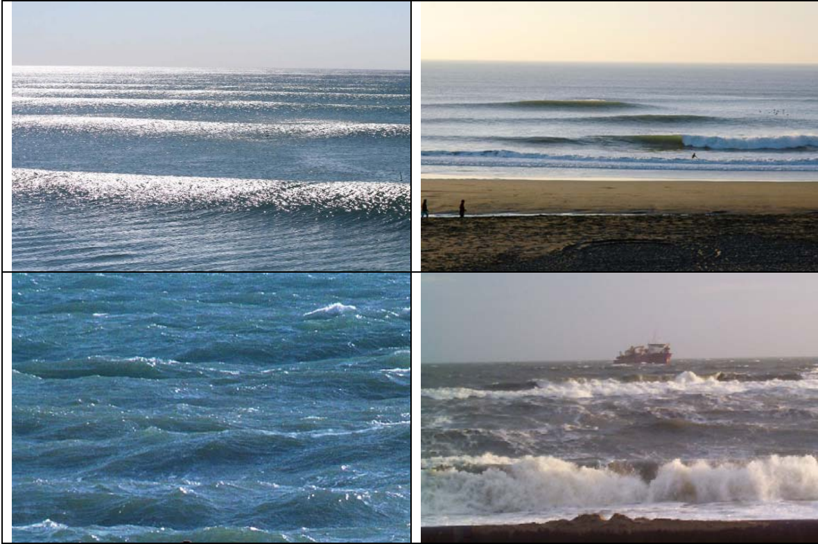
Figure 2. Low frequency, organized, “clean swell” waves (two images on the top) and high frequency, disorganized “wind chop” waves (lower two images).