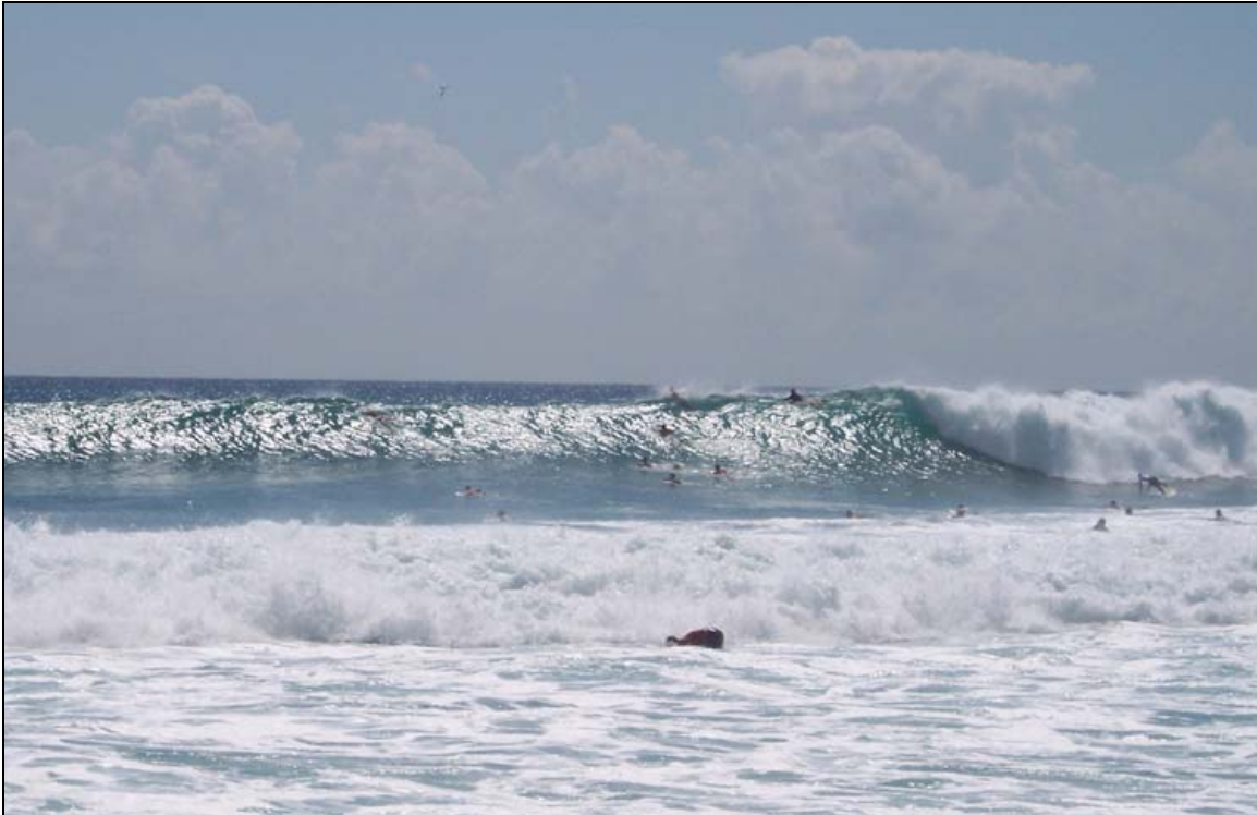
Figure 6. Delray Beach, Florida during Hurricane Isabel in 2003.

It is well known in the local surfing community that Delray Beach is one of the best breaks in southeast Florida today. This point is evidenced by the droves of surfers who show up at the first signs of a new swell as shown in Figure 6 during the Hurricane Isabel swell in September 2003. Upon each nourishment event, local surfers also enjoy surfing a longer peeling wave at the end of the beach fill. After completion of the project construction, the beach and bars are temporarily curved into a taper section at transition between the nourished and non-nourished beach.