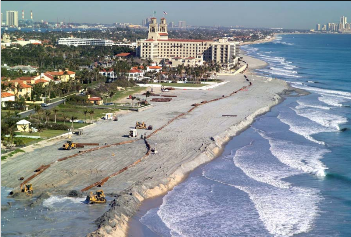
Figure 5. Construction of a beach nourishment project in southeast Florida during a swell event from the northeast (the oblique aerial view is from south to north).

Examples of negative impacts due to beach nourishment include Copacana Beach Brazil, where coarser sediments caused severe beach steepening and the beach turned into a reflective beach type with disappearance of bars, collapsing type breakers and consequently, disappearance of quality surfing waves, or Mammoth County, New Jersey (Walther 2006), where coastal structures responsible for creation of surf breaks were buried by fill sands. Another interesting example of an impact to a surf break related to sand nourishment (or actually lack thereof) is St. Francis Bay Beach in South Africa. In this case, sand dunes adjacent to a famous headland bay point break had been nourishing the beach naturally through wind transport, until they were “stabilized” with vegetation to prevent shifting sands from blowing into nearby housing developments (Mead et al. 2007). The loss of sediment supply resulted in beach erosion and a deepening of the nearshore profile, which in turn prevented the waves from breaking in their former “perfect” peeling fashion.