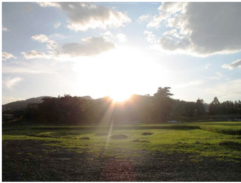
Figure 7. The Sun sets behind Mount Kinkei

Thus from Muryoko-in, souls would first pass through Mount Kinkei, where the kami would bless them; and then be led on to the westerly Pure Land. Further proof of the integration of Buddhism and Shinto beliefs exists in the Buddhist scrolls found buried at the peaks of surrounding mountains to delineate the boundaries of existing Pure Land. Hiraizumi is therefore quite a sophisticated example of the syncretistic role played by kannabi .