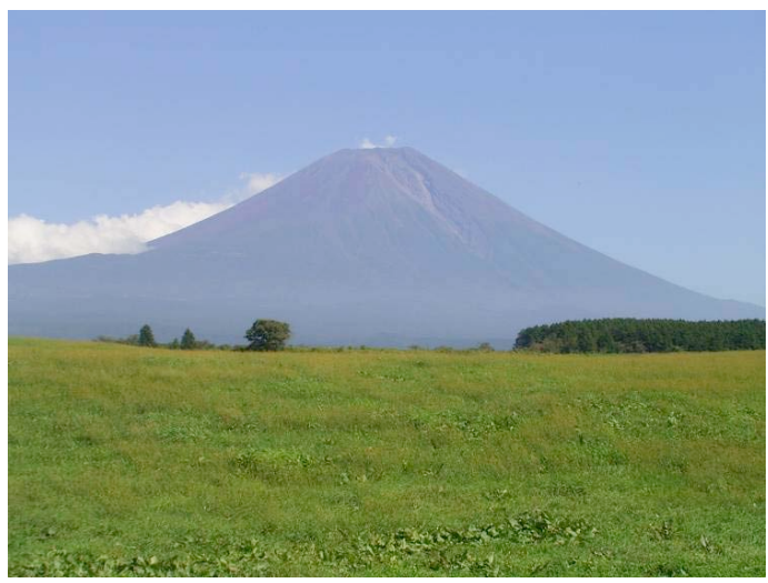
Figure 2. A stratovolcano, Mount Fuji

Active volcanoes are viewed as transcendental beings that possess awesome power to cause catastrophe by eruption. Japan, sitting right on top of the Pacific Ring of Fire, has many volcanoes that have been revered as objects of worship. Mount Fuji, the most prominent mountain in Japan, is also a volcano, which last erupted about 300 years ago. In particular, the stratovolcano's beautiful regular shape often leads to it being revered as sacred. Many archaeological finds have been unearthed from locations from which one can view such mountains. Mount Fuji is surrounded by sengen jinja <sup>3</sup>, shrines dedicated to it, and has its own religious followers, the Fuji-ko. Mount Aso in Kumamoto, while not a stratovolcano, is nevertheless venerated. An active volcano with a huge inhabited caldera, (from the edge of which the volcano vent can be viewed), it has many dedicated shrines in its vicinity. Other examples of this category are Mounts Asama in Nagano, Miharayama in Oshima, Tokyo.