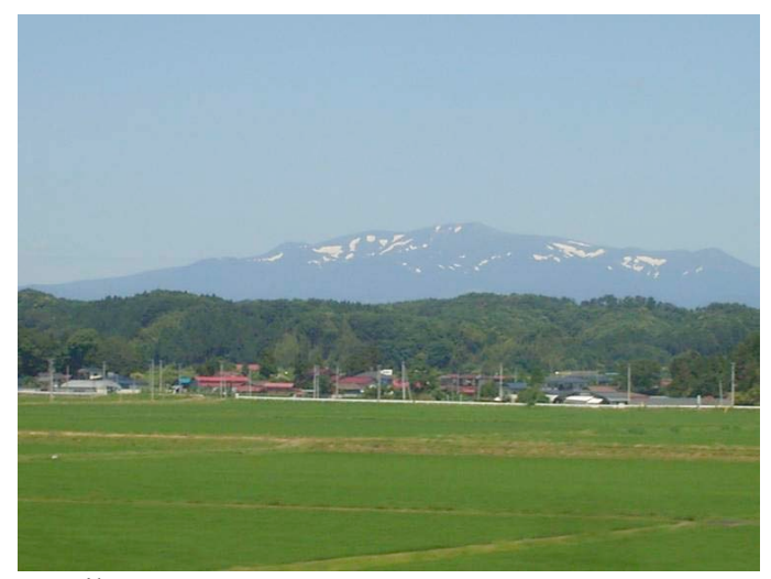
Figure 3. Mount Kurikomayama