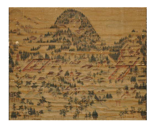
Figure 5. Sannomiya Mandarazu, depicting both temple and shrine complex and kannabi: Sannomiya Mandarazu, Hietaisha shrine 4. Key examples of kannabi: Obama and Hiraizumi

Other variations on kannabi mountains for fishermen can be found along the coast. The concept, however, also embraces other natural phenomena. Isolated islands in bays are also venerated: for example, the island shrines of Itsukushima in Hiroshima, Okinoshima in Fukuoka, Kamishima in Mie, and Chikubushima in Lake Biwa, Shiga.