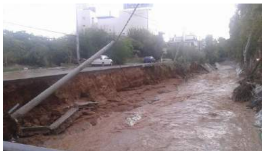
Fig. 9. Urbanization has altered the hydrologic regime and cause flash floods in these environments.

Another major category of floods in the Balkans is within the urbanized areas [26]. More than 40% of flood-related casualties reported in Europe between 1950 and 2006 were from flash floods [28]. In Greece, Athens, Thessaloniki, Patras and Heraklion are located in coastal areas and had above-average flood frequency and an above average number of events [26]. The significant increase in impermeable surfaces in urban catchments as the population exponentially increased in these centers has altered the hydrologic regime (Fig. 9). Infiltration decreases with surface runoff increasing and leading to peak flows (Fig. 1). These types of flood events appear to be on the rise because of the high population density in urban areas, the associated reduction of natural retention areas and the lack of land-use regulations on construction works that are allowed adjacent to the river channels [29].