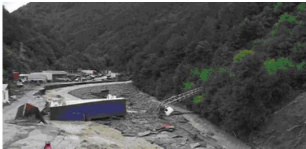
Fig. 7. Flood event damages by the Leskovska River in Leskov dol village, on August 1 st 2014 that is near the Batulijaska River.

These images in Fig. 4-7 illustrate the flood wave time development by showing some of the consequences. The aim is to describe the floods influences on river hydraulics. It is clear that floods can seriously impacts the river bed since after the event it has been totally modified. The significant impacts on the river hydraulics can also be detected. River banks are eroded, huge amounts of the stream load material were deposited downstream, related river bed vegetation is totally destroyed, the river bed profile is changed to a new one with totally different hydraulic properties (cross-sectional area, river bed gradient, river bed roughness, etc.). During the flood some river related and floodplain situated structures and buildings were destroyed. It is possible such structures to lead to a backwater effect and cause additional flood wave rising. The sediment and debris that were transported downstream by the streamflow were either deposited on the specific floodplain area or stopped by some other existing permanent structures. During the process other obstructive occurrences are likely to have been observed causing additional damages. As a result the related flood area was also heavily modified. Consequently the connected natural aquatic and terrestrial ecosystems were also impacted.