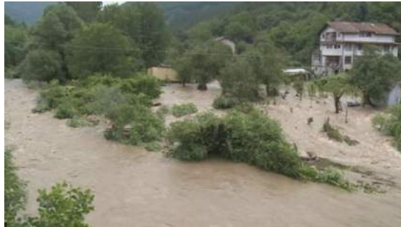
Fig. 4. The Batulijaska River flood event in Rebrovo village zone

To better understand the process of the flood event and some of related impacts, images are illustrated in Fig. 4-7.