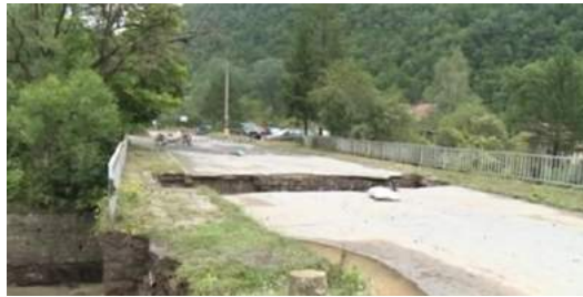
Fig. 6. The Batulija village bridge after the flood event