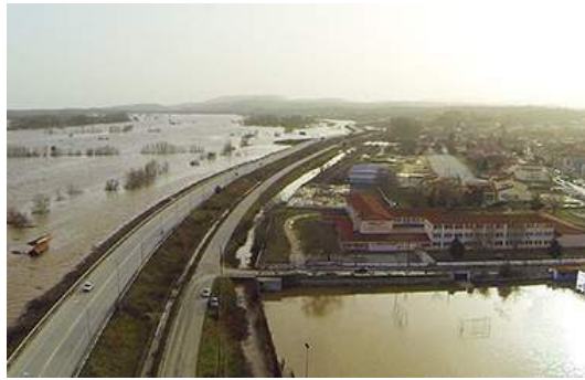
Fig. 8. Breaking of the levees near Sufli led to flooding of the agricultural and rural areas (05/02/2015) that originated from Evros River.

The last major flood event that started in December 2014 and lasted till May 2015 (Fig. 8). This flood caused 54 houses to be evacuated and 23,000 ha of agricultural fields were flooded because the river levees were broken at 84 points. The flood had a devastating effect on the local economy that depends primarily on agriculture. Major floods have also occurred along the Evros River in 1996, 1997, 1998, 2005, 2006, 2010 and 2012 that indicates that is a repeated problem. Typically these floods and flood waves are more predictable although the overall flood events can last for long periods of time. Still despite being more predictable these problem continues.