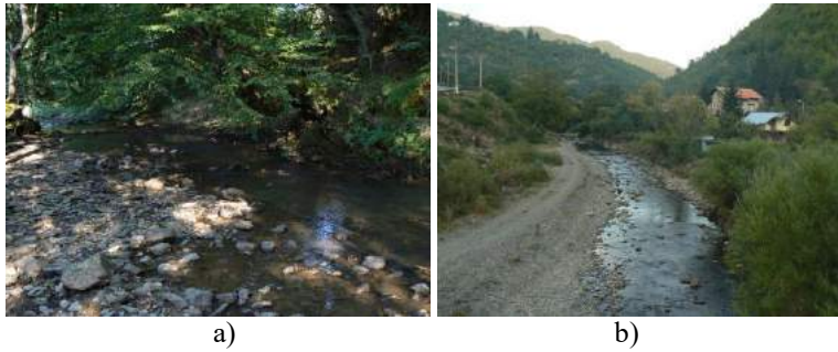
Fig. 3. Batulijaska River: a) River streamflow near Jablanitza village during the summer, b) Batulijaska River close to the point, where it joins Iskar River during summer flow conditions.

To better understand the process of the flood event and some of related impacts, images are illustrated in Fig. 4-7.