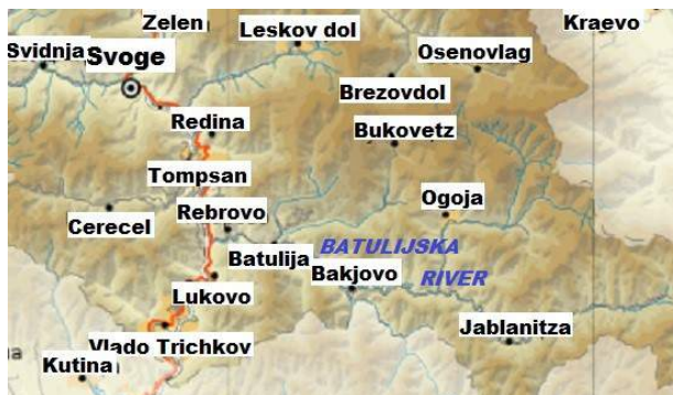
Fig. 2. The location of Batulijaska River.

Batulijaska River is a tributary to the Iskar River. It runs near Murgash hut, situated in Murgash Mountain, part of Stara Planina Mountain and flows to north-west. After passing the Batulija village it meets Iskar River (Fig. 2).