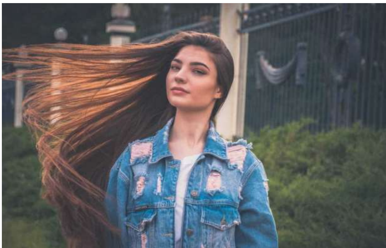
Figure 13. Woman with long beautiful hair [187,188]. The main purpose of shampoo is to remove dirt and oil from the surface of the hair fibers and the scalp, while the main purpose of conditioner is to ensure that the hair is smooth for combing. Shampoos typically contain a primary and a secondary surfactant for thorough cleaning, a viscosity builder, a solvent, conditioning agents, pH adjuster and other non-essential components such as fragrance and color for commercial appeal. Conditioners usually contain silicone polymers to increase shine and soften hair, cationic polymers such as quaternary nitrogen compounds to reduce static electricity, bridging agents to increase absorption, viscosity builder, pH adjuster and components for commercial appeal.