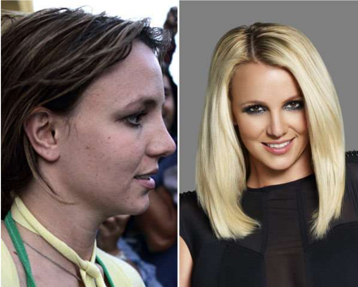
Figure 9. Pimpled and no pimpled Britney Spears [185,186]. At glamorous, Hollywood events, the “... baby one more time” star Britney Spears' skin seems flawless, but in reality, this is far from the truth: redness, pimples, rashes – the singer knows all of these problems too well, first hand. However, Girls and women often use concealer or foundation to cover up their pimples. This makes them feel more comfortable in public. Young men sometimes use subtle foundation, powder and concealer as well.