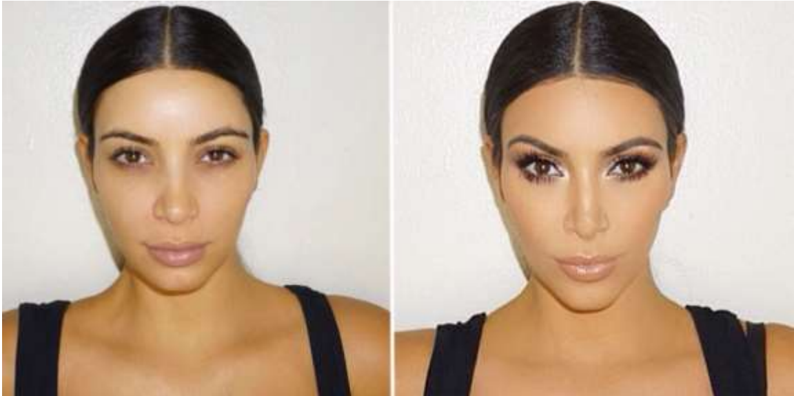
Figure 14. Contouring [182]. Contouring is the newest makeup craze that people just can't get enough of! This trend, made famous by none other than the Kardashian sisters, was created to make your face appear slimmer and more sculpted. The basic premise of it is to highlight the areas of face that someone would like to bring out, while shading in the parts she wants to make thinner.