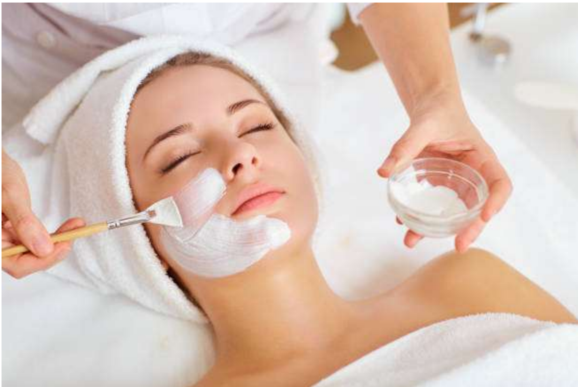
Figure 12. Facial Treatment [177-180]. Facial masks are the most prevalent cosmetic products utilized for skin rejuvenation. Facial masks are divided into four groups: (a) sheet masks; (b) peel-off masks; (c) rinse-off masks; and (d) hydrogels. Each of these has some advantages for specific skin types based on the ingredients used. Peel-off facial masks are known for their unique characteristics inherent to the use of film-forming polymers that, after