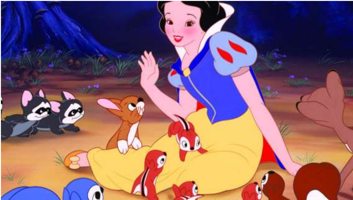
Figure 10. Disney princess, Snow White (Fairy Tale) [172,173]. In the time that Snow White was released it was a common for the majority of women desired to have blush in their faces like her. Rouge originated as a thick paste, and was made from a range of things: from strawberries, to red fruits and vegetable juices, to the powder of finely crushed ochre. As nouns the difference between blush and rouge. is that blush being an act of blushing or blush can be the collective noun for a group of boys while rouge is red or pink makeup to add color to the cheeks; blusher. Blushers, those versatile successors to rouge, help light up a complexion and accent face structure and best features.