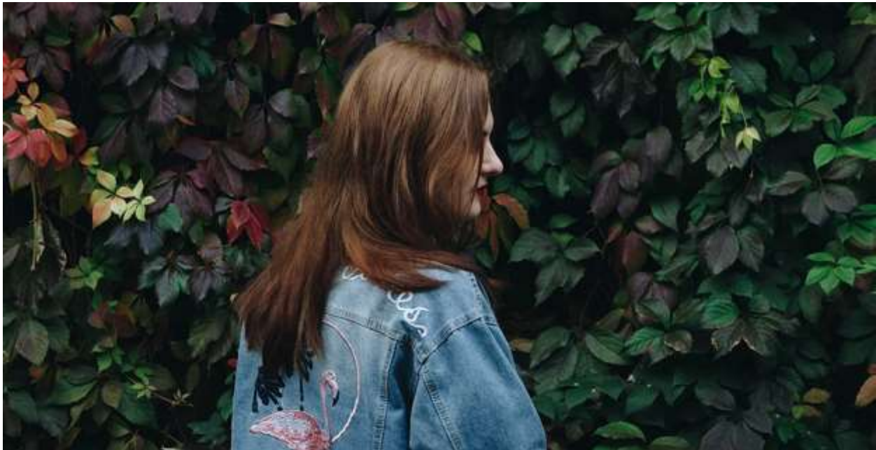
Figure 3. How Do Plant Stem Cells Help Hair Growth? [69,70]. Plant stem cells possess similar genetic factors as human stem cells and can be used to influence the function of certain cells in our skin and hair follicles. Active plant stem cells work to increase the lifespan of hair follicles so that hair can remain in the anagen phase of the hair growth cycle for a longer period of time. Another hair-growth benefit of Asparagus Stem Cells is their ability to block the most common hair-killing hormone, DHT. High levels of DHT, as well as sensitivity to the hormone, are known for causing most male-pattern baldness and even female alopecia. Asparagus Stem Cells can aid the receptors in the skin to block the intrusion of DHT, and therefore minimizing the hair loss caused by it.

effective beauty products for their needs – and value is determined first on efficacy. On the face of it, reaching today's consumers and winning their buy for the long term seems an ever more daunting proposition, but their quest and hunger for ever more efficacious and intriguing products actually translates to more opportunities to innovate for new unmet needs. Turning innovation into success, though, will truly depend on an open and honest conversation with consumers – listening to their needs and being as clear as possible about claims and the potential for any given product. Brand owners must convey the value of new ingredients, formulas and products through clear language, with explanations of benefits based on scientific studies or other trials. Backing good ingredients and products by developing smart marketing campaigns that are able to convey appropriate expectations from the use of products will foster a significant connection with consumers – and that translates to the growth of business.