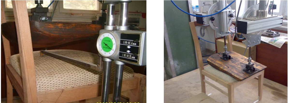
Figure 2. Experimental setup