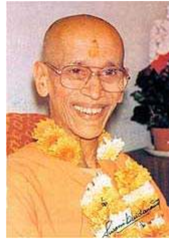
Sri Swami Chidananda

SERVE, LOVE, GIVE, PURIFY, MEDITATE, REALIZE So Says Sri Swami Sivananda