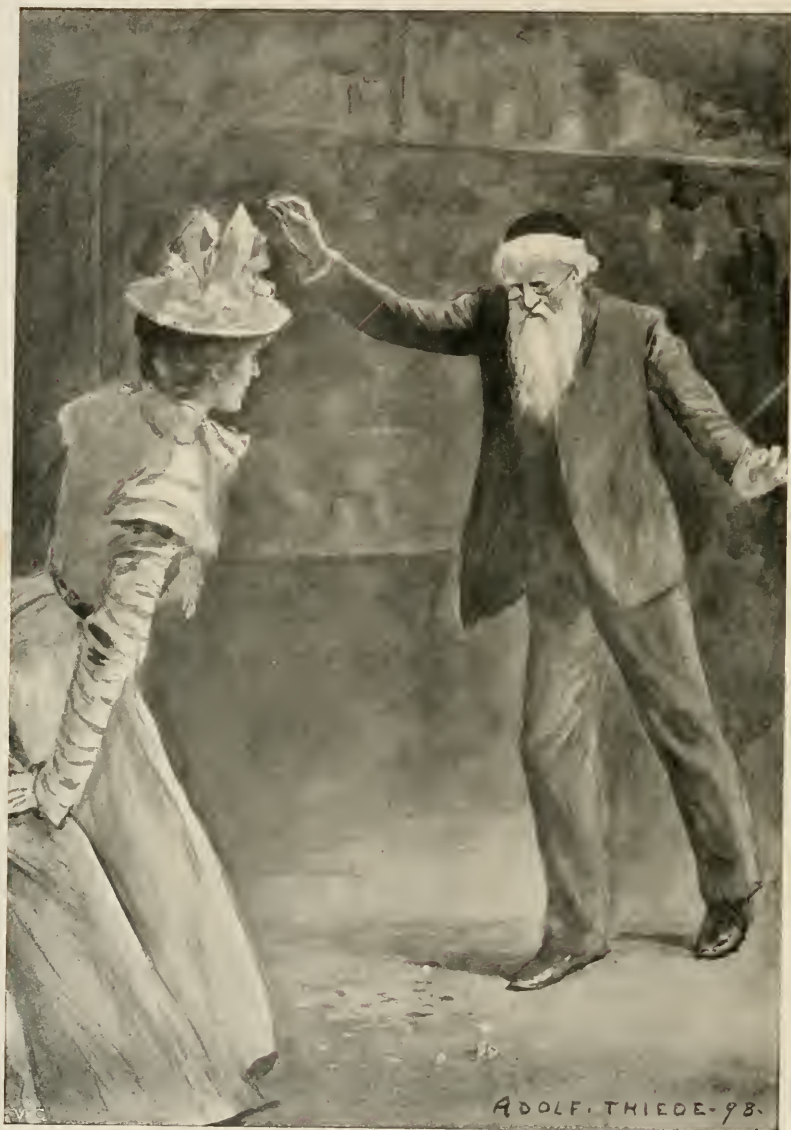
"Her disagreement with her uncle" (page 40) The Leavenworth Case