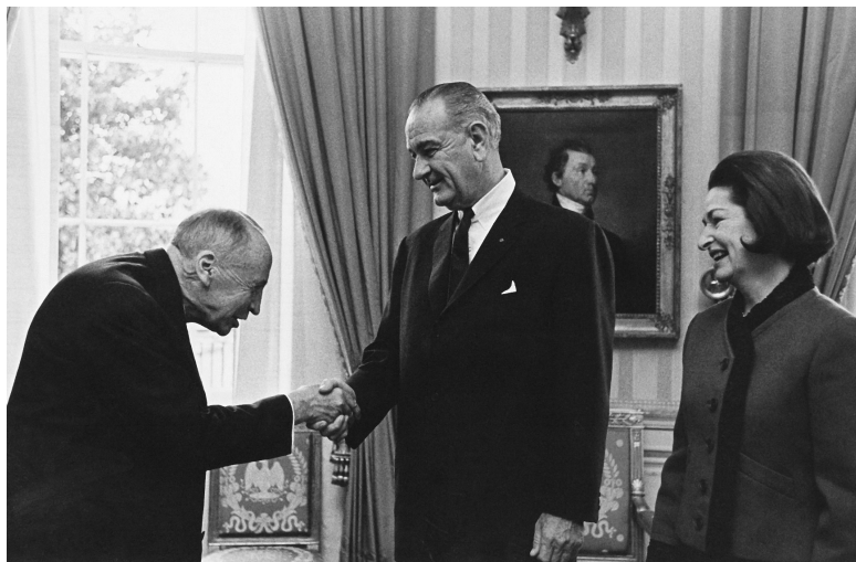
Figure 7.3: Van Vleck receiving the National Medal of Science in 1966 from President Lyndon B. Johnson with Lady Bird Johnson looking on.

Over the same period, Van Vleck had been busy pursuing the line of inquiry that would secure him fame as an expert in magnetism. He published a three-part paper that advanced a general theory of susceptibilities (Van Vleck 1927a; 1927b; 1928a). This trilogy would form the basis for The Theory of Electric and Magnetic Susceptibilities (Van Vleck 1932b).