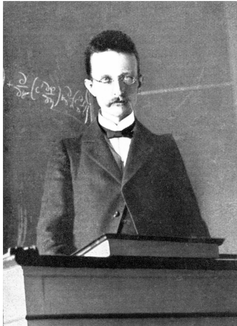
Figure 3.1: Max Planck teaching, late 1880s.

semester 1905/06" (Planck 1906, iv). Even though the structure of the book exhibits many similarities to Planck's Vorlesungen über Thermodynamik , the lectures on the theory of heat radiation certainly read more like a textbook. Compared to his earlier text on thermodynamics, Planck's work on heat radiation is less focused on his own research, and in addition, it discusses the subject much more comprehensively—in the manner of an "introduction to the study of the entire theory of radiative heat on a uniform thermodynamic foundation" (Planck 1906, iii). With this text Planck provided what has come to be recognized as the first comprehensive account of the theory of radiation.