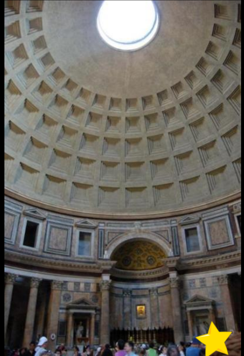
Pantheon, Rome, Italy. 125-128 CE

These decorative panels are called coffers . Coffers not only made the dome visually more appealing, but greatly lightened the load of the dome to prevent cave ins.