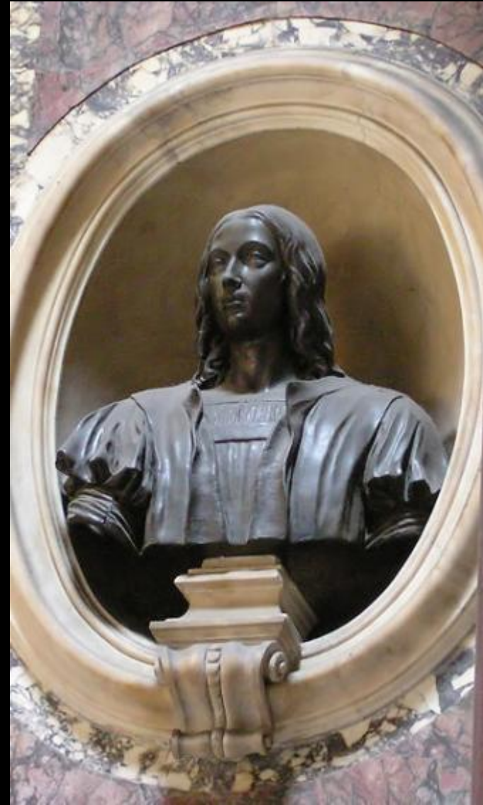
Raphael's tomb – in the Pantheon