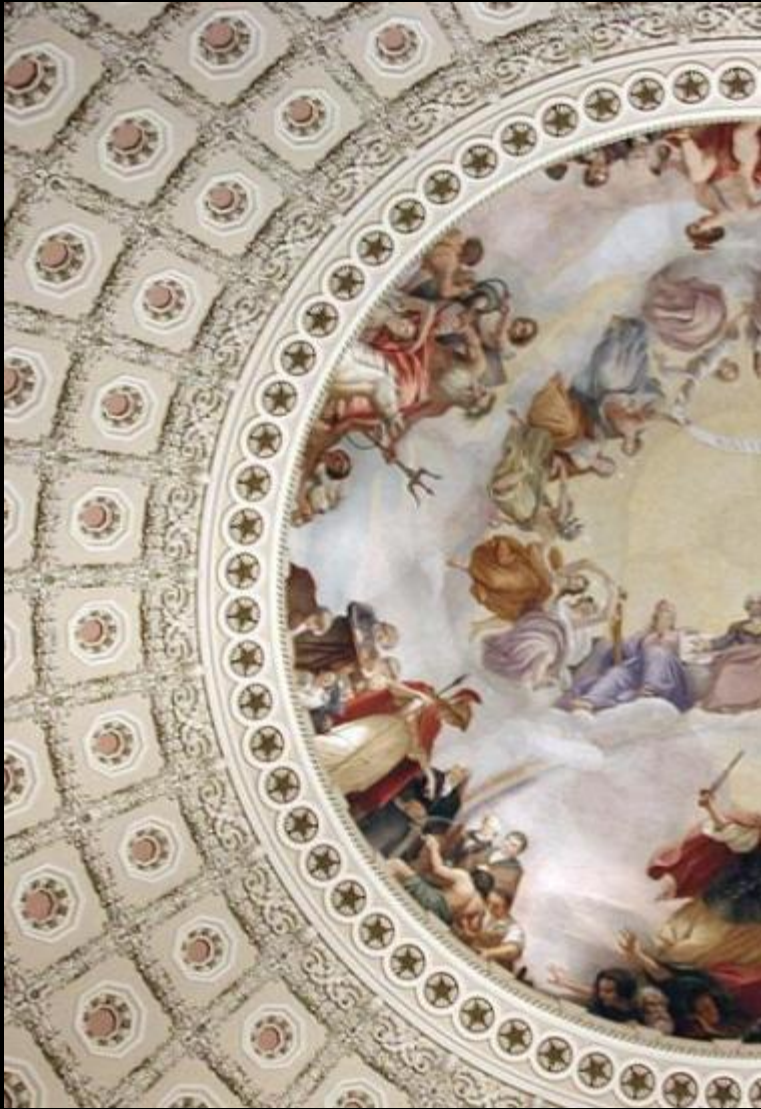
Inside of U.S. Capitol Dome