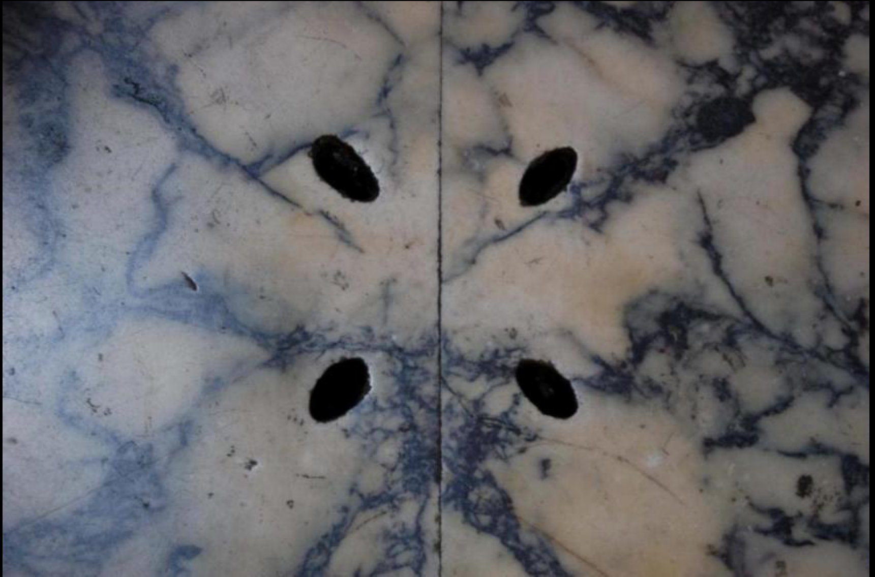
Rain drain directly underneath the oculus!