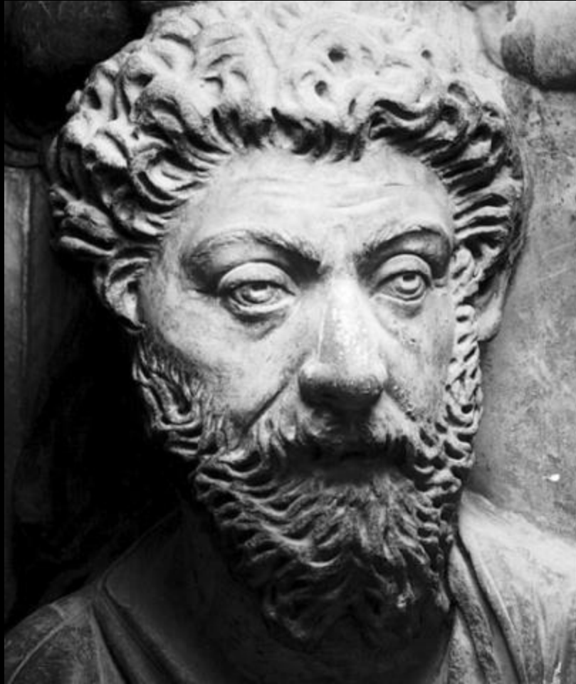
Portrait of Marcus Aurelius