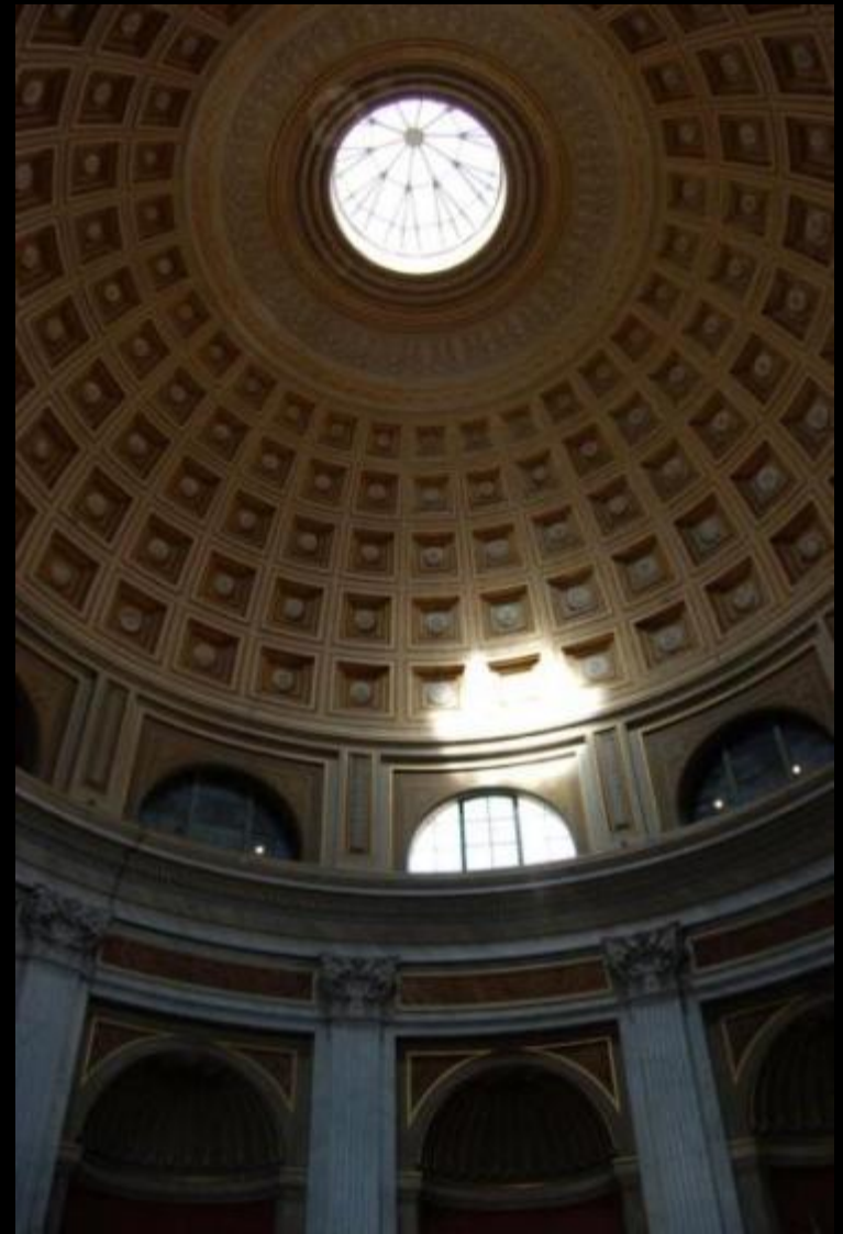
Dome Room in Vatican