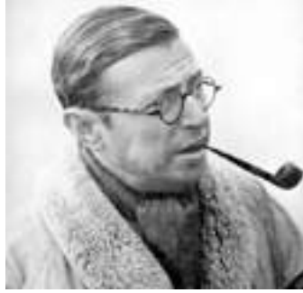
Jean-Paul Sartre , University of Pavia Galleries

About the author... Jean-Paul Sartre (1905-1980), a leading existentialist in post World War II France, advocates the radical freedom and concomitant personal responsibility of the individual. Although recognizing the constraints of the human condition and the limitations imposed by our environment, he also emphasizes the Cartesian assumption of the freedom of human consciousness. If we try to be “somebody” or “something,” Sartre argues we become inauthentic and are acting “in bad faith.” To try to make something of ourselves, as a purpose of life, is a mistake, for such an attempt would only tend to objectify what we are. No one wishes to be regarded as an object. Instead, Sartre emphasizes that each person is entirely the author of his choices—all significant aspects of choices are unconstrained by outside influences. When in 1960 Sartre exhorted the troops in the French Foreign Legion fighting in Algeria to desert, de Gaulle was asked why he took no action against Sartre. President de Gaulle replied, “One does not arrest Voltaire.” In keeping with Sartre’s view of authenticity, while declining the Nobel Prize for Literature in 1964, Sartre replied, “A writer must refuse to allow himself to be transformed into an institution.”