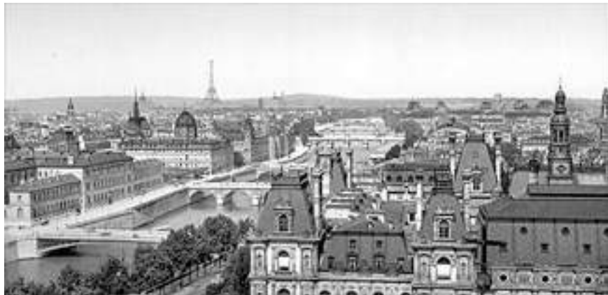
Seven Bridges, Paris

“There is no other universe except the human universe, the universe of human subjectivity.”