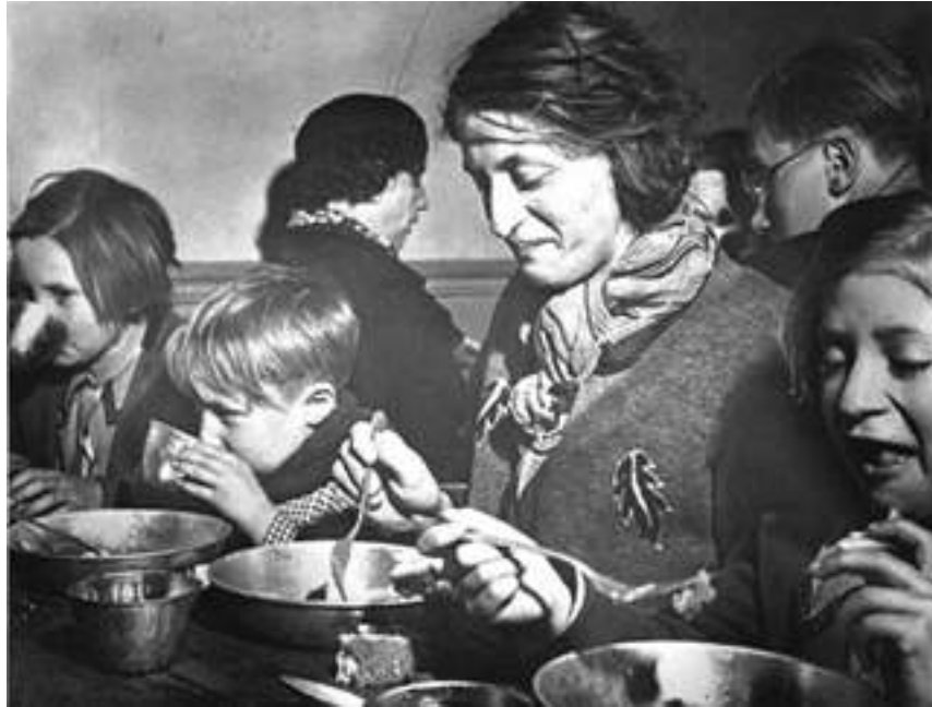
Paris, France, Refugee Camp WW II

What is at the very heart and center of existentialism, is the absolute character of the free commitment, by which every man realizes himself in realizing a type of humanity—a commitment always understandable, to no matter whom in no matter what epoch—and its bearing upon the relativity of the cultural pattern which may result from such absolute commitment. One must observe equally the relativity of Cartesianism and the absolute character of the Cartesian commitment. In this sense you may say, if you like, that every one of us makes the absolute by breathing, by eating, by sleeping or by behaving in any fashion whatsoever. There is no difference between free being—being as self-committal, as existence choosing its essence—and absolute being. And there is no difference whatever between being as an absolute, temporarily localized that is, localized in history—and universally intelligible being.