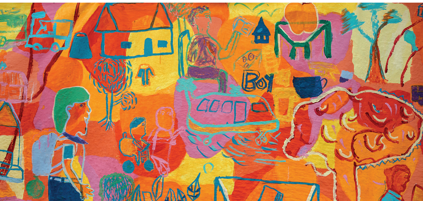
The drawings are from an exchange mural by youth participants of a joint human rights-based workshop led by the Education Above All Foundation and Artolution in Bidi Bidi Refugee Settlement in Uganda.

This International Law Handbook on Protecting Education in Insecurity and Armed Conflict explains how key international law regimes (international human rights law, international humanitarian law, and international criminal law) protect education, students, teachers, and schools. It also considers the mechanisms that can be used to obtain reparation for education-related violations. Such examination is essential for both the protection of education itself and for the benefits that derive from it. This Second Edition of the Handbook has been fully revised and updated, including the latest legal developments and case-law.