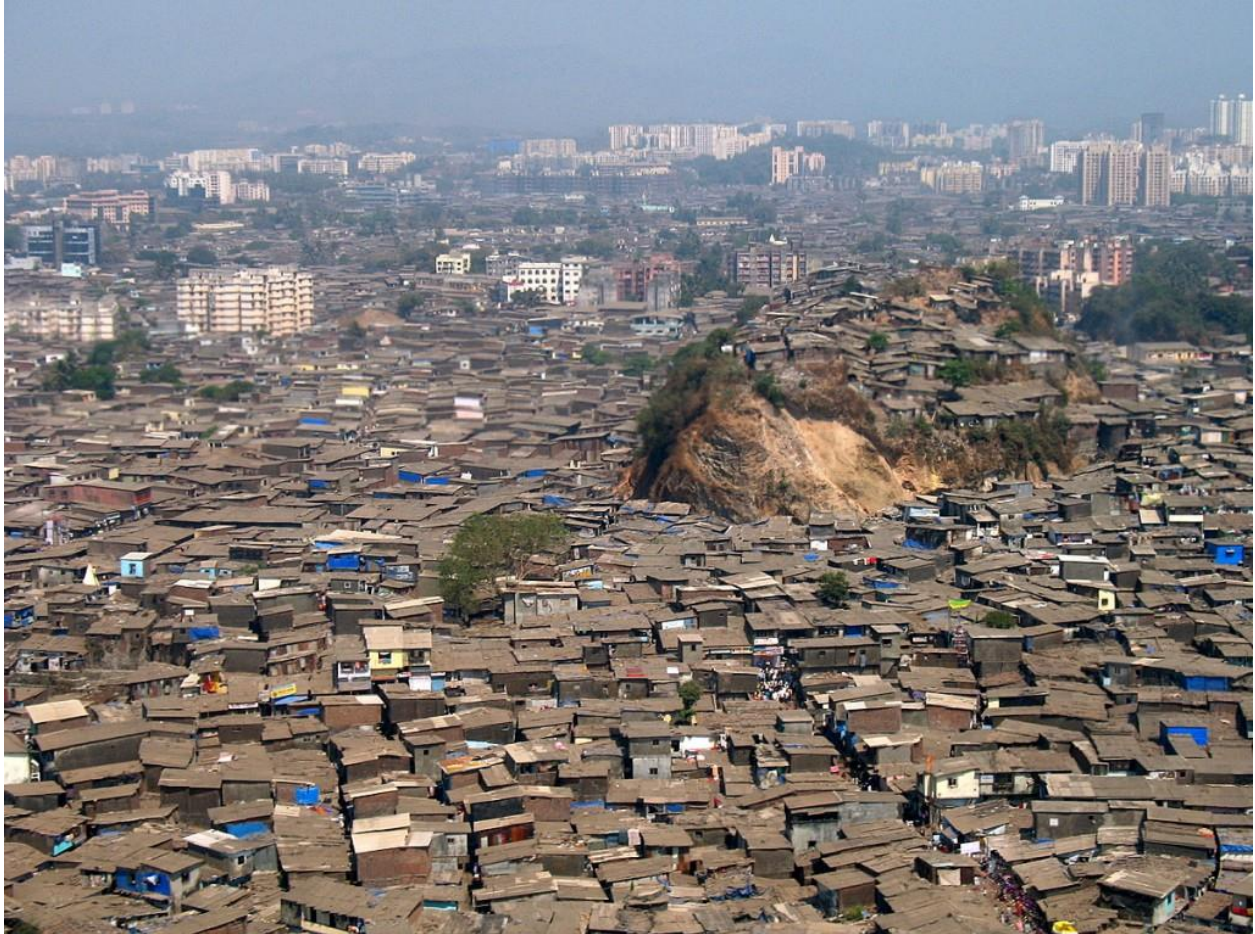
Example 2: Slums in Dharavi, Mumbai of India