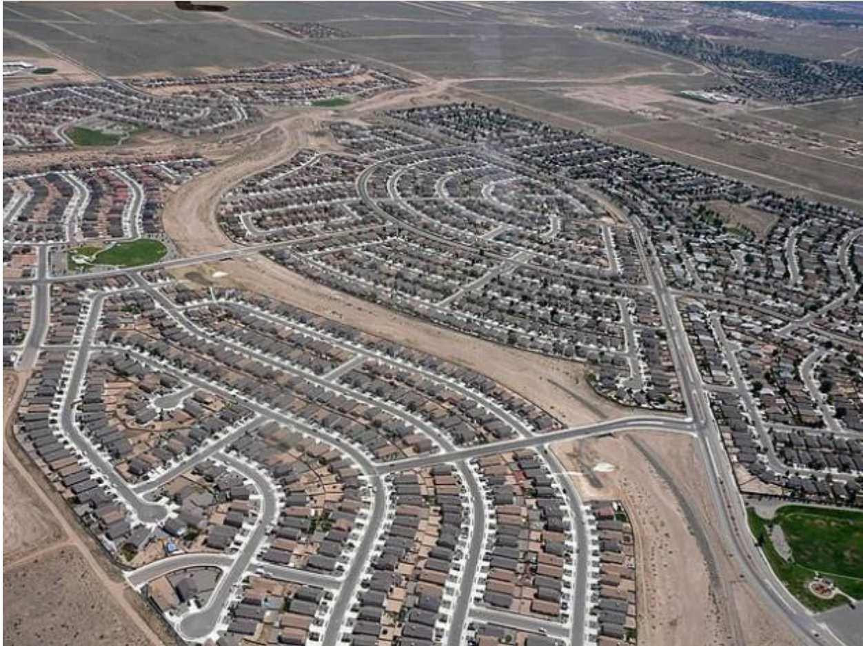
Example 3: Urban Sprawl in Rio Rancho, New Mexico, USA