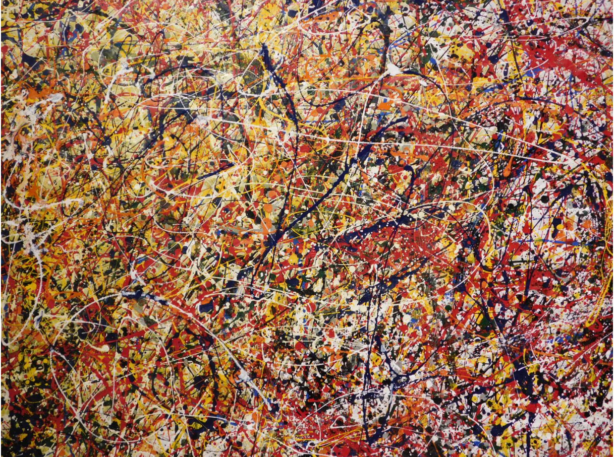
Picture 2: Jackson Pollock: Drip Painting, 1951.

painting closer to the work of Jackson Pollock (Picture 2) describes urbanism more accurately. If this can be imagined as a moving picture where drips of color are being added and removed throughout time, then somehow, the definition of urbanism can be grasped.