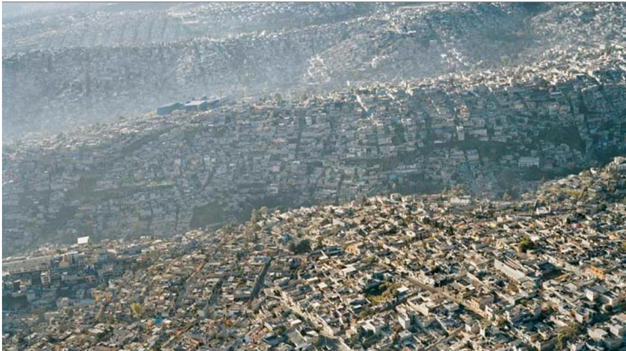
Example 1: Mexico City

which was designed by technocrats. This theory was later described as rational urbanism. This continued strongly throughout the movement of modernism but changed as more examples of failed urban designs emerged. As a reaction to rational urbanism, new theories such as new urbanism, landscape urbanism, cooperative urbanism, and tactical urbanism became the most widely accepted theories. However, the speed of urbanization was not equally matched by the speed of the evolutionary theories of urbanism. This resulted in some extraordinary examples of urbanism but also to many of the urban problems the cities are facing today. It is the bad examples that are showing the importance but also the insufficiency of current discussion about urbanism. These are four chosen examples from the world that have different causes but they all culminate to the importance of urbanism.