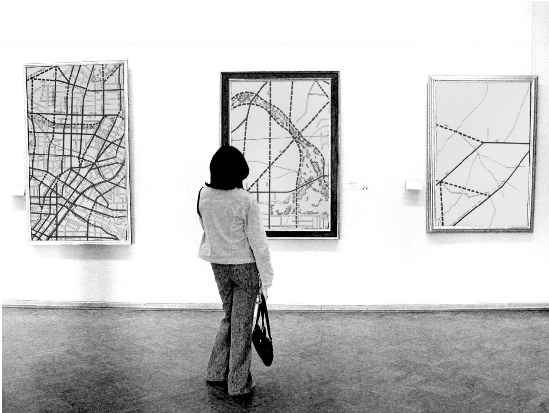
Picture 1: Urbanism is passive, as paintings on a wall

Rem Koolhaas, in his paper "What Ever Happened to Urbanism", criticizes its inability to act. "Urbanism, as a profession, has disappeared at the moment when urbanization everywhere – after decades of constant acceleration – is on its way to establishing a definitive, global "triumph" of the urban condition."