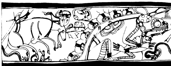
Fig. 4: Vase in private collection; height 14 cm, diameter 12 cm. Drawing after Justin Kerr's photograph published in Robicsek and Hales 1981: vessel 43.

But of the majority of episodes from ceramics we know almost nothing. The interpretations that considered everything as some episode from the “Popol Vuh” did not lead us too far, and the number of scholars attempting with other approaches increases. The great progress made in the decipherment of Maya hieroglyphs might increase our knowledge – but it still does not mean that we will automatically be able to understand their myths. As was already mentioned above, we need sources.