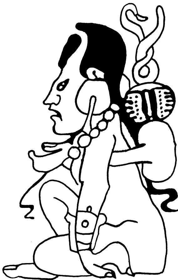
Fig. 1: Ixchel as a goddess of fate as depicted in the "Codex Dresdensis," 19 c.