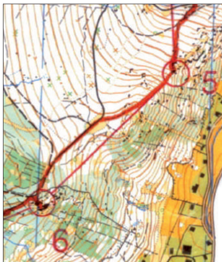
Fig. 1 Examples of “a step by step” strategy