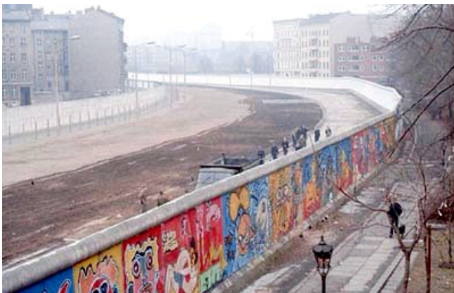
Updated: June 2017 The Berlin Wall was a symbol of the Cold War.

The Berlin Wall divided the city until 1989, the year communism began to fall in Eastern Europe.