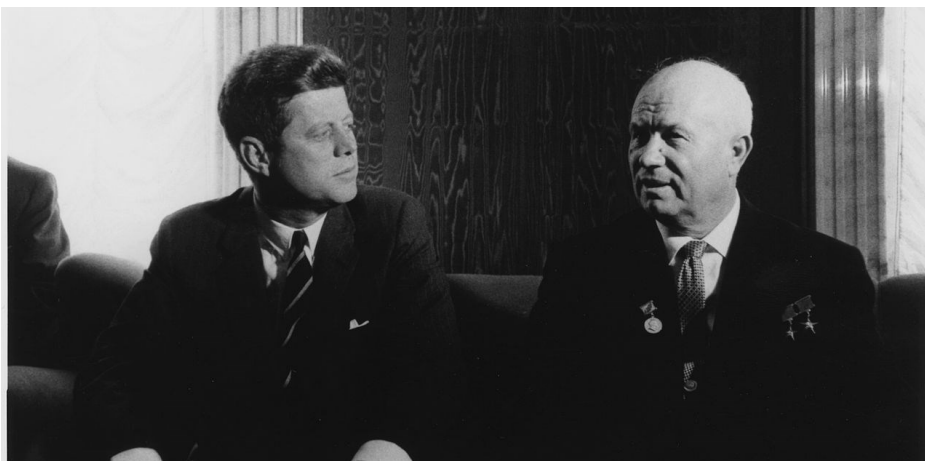
US President John F. Kennedy meets Soviet Premier Nikita Khrushchev in Austria, a country that remained neutral during the Cold War. The two leaders narrowly avoided nuclear war during the Cuban Missile Crisis.

The Soviet Union invaded Afghanistan in 1979, fighting to install a communist government. The US provided support to insurgent groups, known as the mujahideen. The USSR fought the costly war for nearly 10 years before withdrawing in 1989 as the Cold War was coming to an end.