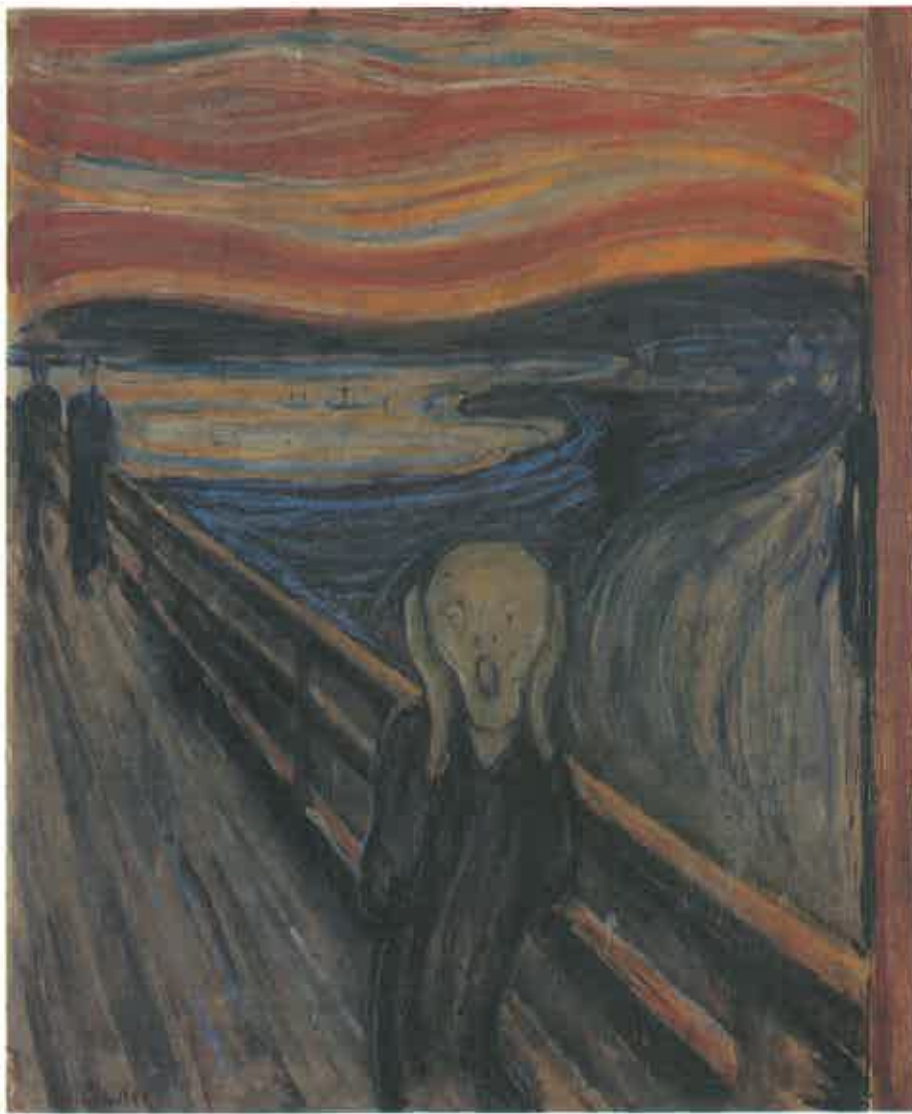
THE SCREAM Edvard Munch Nasjonalgalleriet, Oslo

away. A pine one. The oak ones, I imagine, would be too expensive for him.”