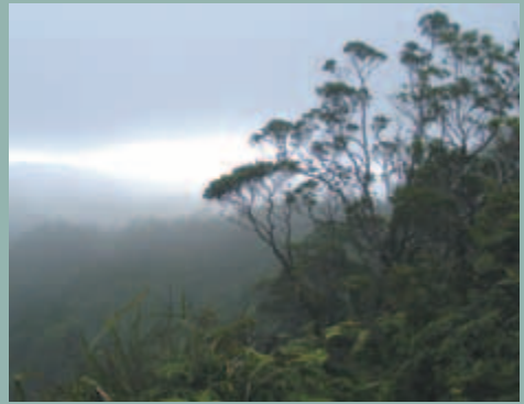
US Army Garrison Hawaii

After biologists in the FWS or NOAA Fisheries identify critical habitat, the agency publishes proposed boundaries in the Federal Register . 34 After receiving and considering public comments, the boundaries of the critical habitat area are finalized and protections for these lands begin. Critical habitat seeks to address the actions of federal agencies. Although private land can be designated as part of a species' critical habitat, private land is affected only if federal funds, permits, or participation is involved in an activity.