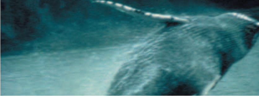
Breaching humpback whale