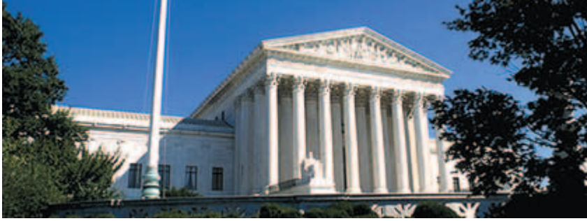
The Supreme Court