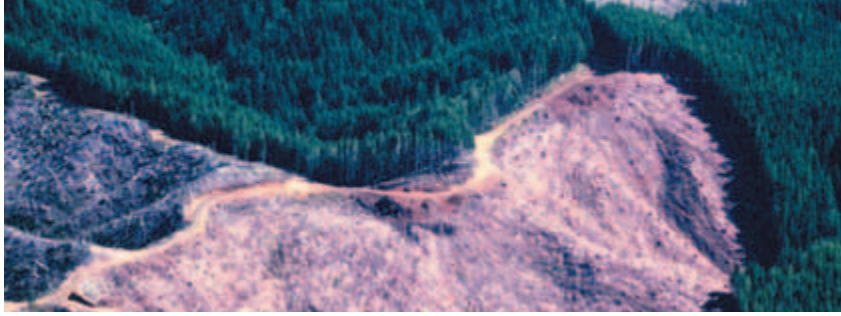
Pacific Rivers Council

Clearcutting denudes hillsides and leads to erosion that damages wildlife habitat.