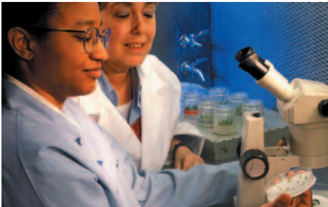
The environment may provide cures for diseases.