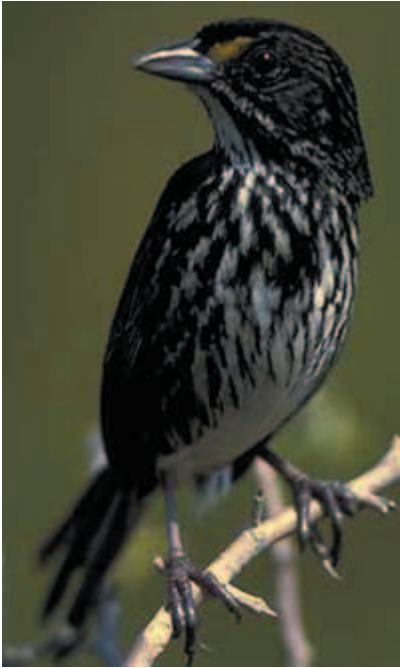
The dusky seaside sparrow became extinct in 1987.