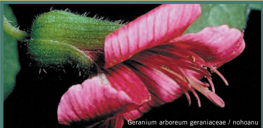
Geranium arboreum geraniaceae / nohoanu