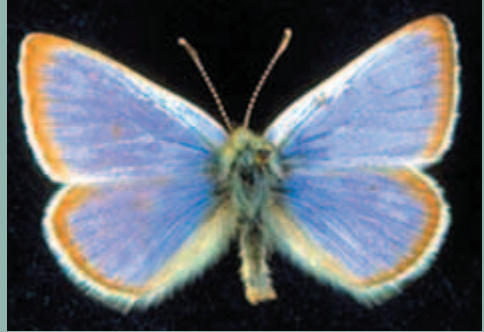
Mission blue butterfly

http://endangered.fws.gov/esa.html#Lnk04 .