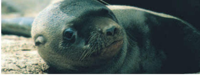
Stellar sea lion pup basking on beach