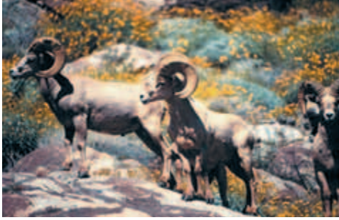
The peninsular bighorn sheep was listed as a result of citizen petitions.