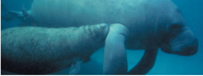
West Indian manatee cow and calf