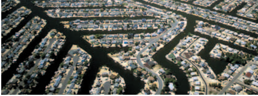
Alex Maclean, Landfills Aerial Photography