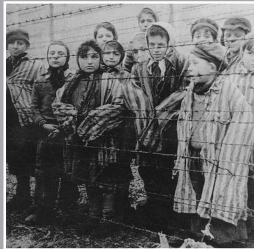
Child survivors of Auschwitz. They were liberated from the Auschwitz concentration camp by the Red Army January, 1945.