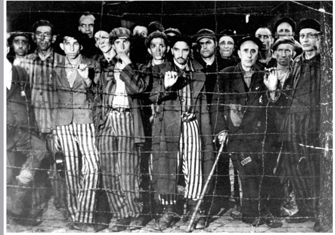
Margaret Bourke-White's photograph of the "living dead of Buchenwald," April 13, 1945. Concentration survivors liberated by American forces. © Time & Life Pictures/Getty Images.