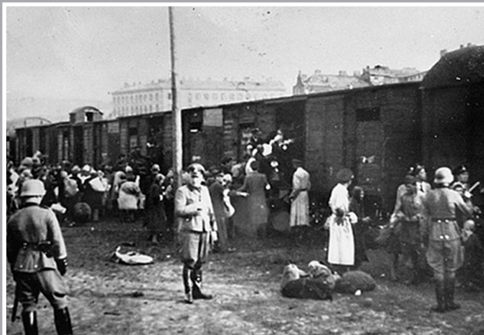
Jews from the Warsaw ghetto boarding onto a deportation train.

Upon arrival at the camps, the Nazis began their "selections," sending victims to the right or to the left. Strong, young prisoners were sometimes "lucky" and were kept alive for slave labor. But even most of them eventually succumbed to starvation and disease. For the vast majority of women with children, people who were sick, older adults, and others "of no further use," death was almost immediate. These people were marched hurriedly to a building containing gas chambers. They were ordered to