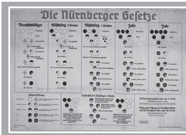
1935 chart from Nazi Germany used to explain the Nuremberg Laws, which employed a pseudo-scientific basis for racial identification.

Under the banner “The Jews are our misfortune,” between 1933 and 1939 the Nazi State legislated restrictions against Jews designed to force them out of Germany’s economic, political, and social life. All non-Aryans (who had Jewish parents or two or more Jewish grandparents) were expelled from the