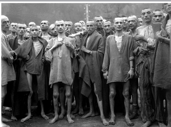
Starved prisoners, nearly dead from hunger, pose in concentration camp in Ebensee, Austria. The camp was reputedly used for "scientific" experiments. It was liberated by the 80th Division. Photo courtesy of National Archives and Records Administration, College Park, MD ARC #531271.