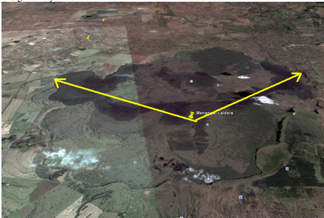
FIGURE 4: Satellite image of Menengai caldera. The dark lava flows on trachytic eruptive centres imply orientation to the northeast and northwest and these can be inferred as structures.

Geological structures (Faults and fractures). Faults and fractures always indicate movement within the earth's crust. They are distinguished from each other by whether displacement (lateral or vertical) has taken place; faults show displacement whilst fractures do not. Differences aside, the mapping of these structures needs to be done meticulously due to the fact that these structures may easily be confused with simple erosional surfaces. Erosional surfaces may sometimes be an indication of an underlying structure. The disparity is whether any observable disturbance can be seen in the bedrock. Structures like geological features may not always be obvious on the surface. In volcanic areas, they may manifest as volcanic centres or fumaroles oriented in a linear direction which become obvious once a map is compiled. Thus it is imperative to be accurate in measuring all formations and structures with well calibrated equipment so that if extrapolations are to be made for modelling purposes the error margin is very slim.