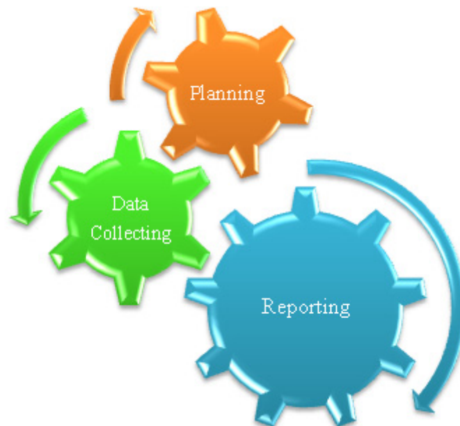
FIGURE 2: Phases of geological field mapping.

Field mapping projects are carried out in three phases which have a stepwise relationship.