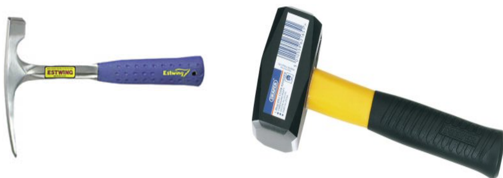
FIGURE 3: Chisel head and crack geological hammers