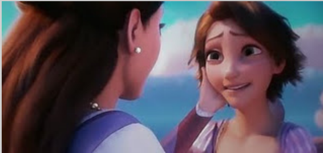
From the movie "Tangled"

TWO SHOT – a scene between two people shot exclusively from an angle that includes both characters more or less equally . It is used in love scenes where the interaction between two characters is important .