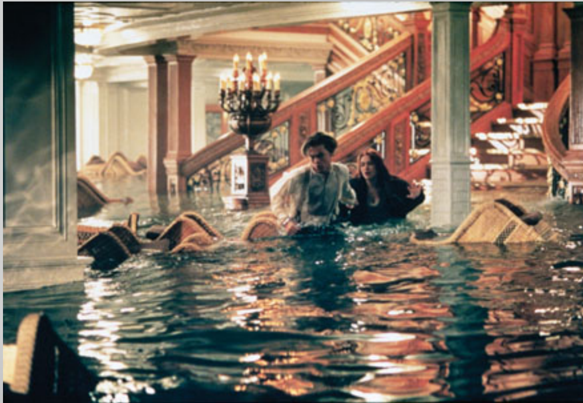
From the movie "Titanic"

LONG SHOT – a shot from some distance. If filming a person, the full body is shown . It may show the isolation or vulnerability of the character