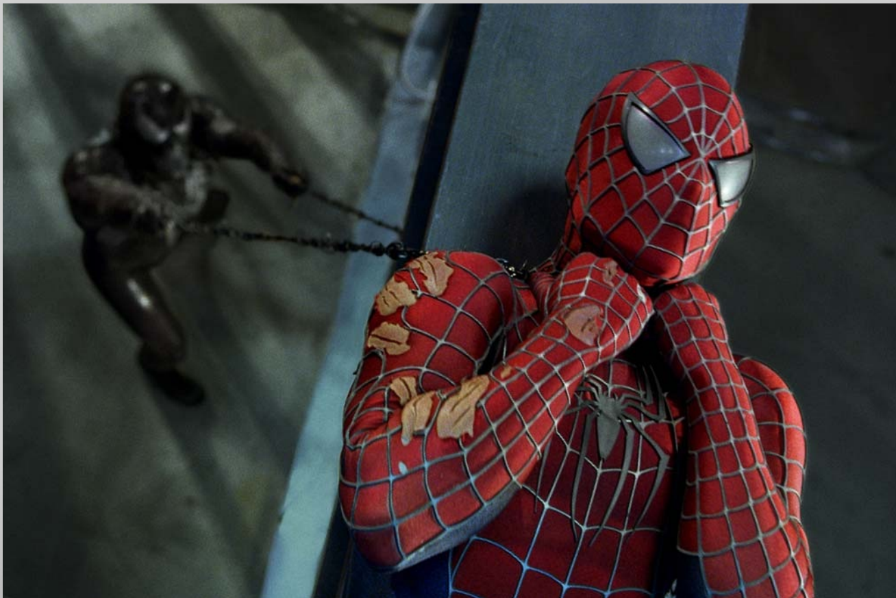
From the movie “Spiderman 2”

MEDIUM SHOT – the most common shot. The camera seems to be a medium distance from the object being filmed. A medium shot shows the person from the waist up. The effect is to ground the story.