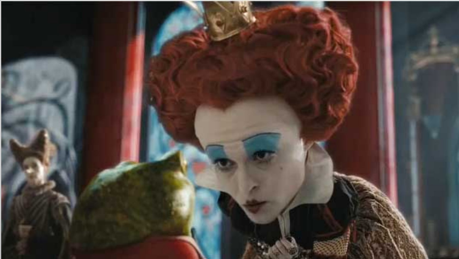
From the movie “Alice in Wonderland”

LOW ANGLE — the camera films subject from below . This usually has the effect of making the subject look larger than normal , and therefore strong, powerful, and threatening .