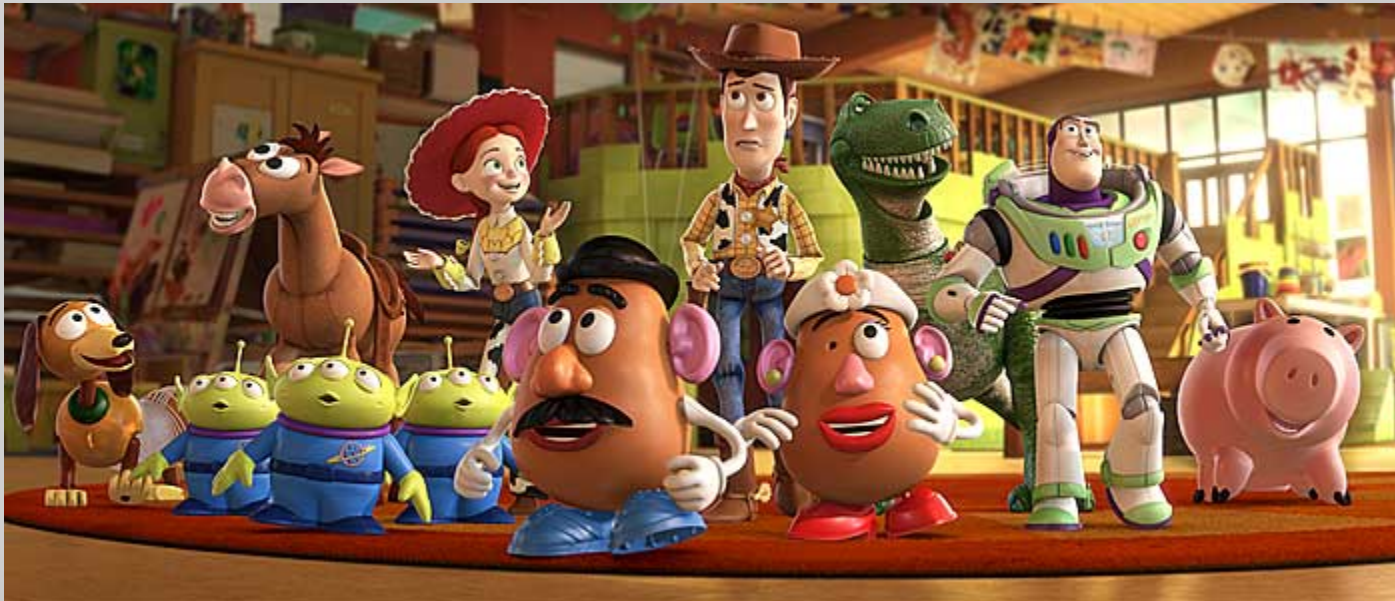
From the movie “Toys”

EYE LEVEL — a shot taken from normal height; that is, the character's eye level . Ninety to ninety-five percent of the shots seen are eye level, because it is the most natural angle .