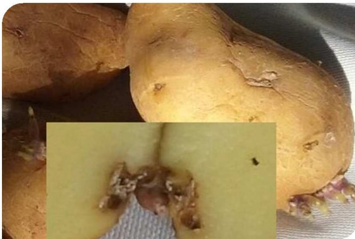
Silicea 30 CH 1 drop in water