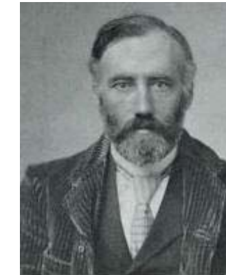
William Quan Judge