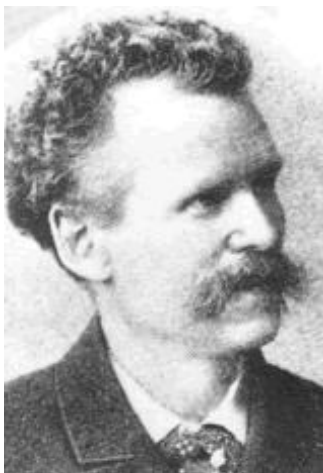
Daniel Dunglas Home

The pattern of crisis management was not much changed when Helena and Henry arrived in Bombay. Helena was immediately disappointed with the reception committee, or lack of same. In a letter to her sister Vera, Helena complained about being met by a group of half-naked dancing girls which provided, as transport, an elephant! The person who was to officially meet them, Chintamon, was late. Next day they were given a great feast attended by hundreds. HBP and Olcott thought that their fortunes were