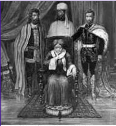
Blavatsky and Mahatmas

SPR decided to investigate the Theosophical Society itself. The objects of their investigation were: