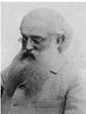
Henry Steele Olcott

Olcott was agricultural editor of the New York Tribune (1858–60.) He had served in the Civil War and afterward was admitted to the bar in New York City. With the rank of Colonel, he was special commissioner in the U.S. War and Navy departments (1863–66). He was a VIP, a “very important person.” He was also the most naïve person one would ever stumble across, though that only became obvious through the years. Helena could get him to “see” semi-transparent Hindus, or believe that letters (written by her but alleged to be by Koot Hoomi) materialized on his desktop. Henry, like