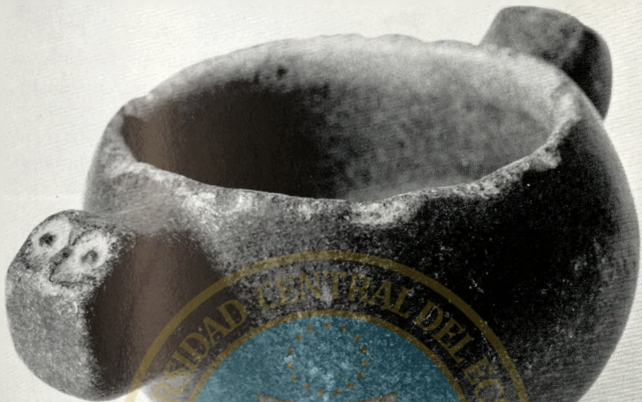
Inca Ceremonial Stone Bowl, Cuzco Late Horizon 4-7980