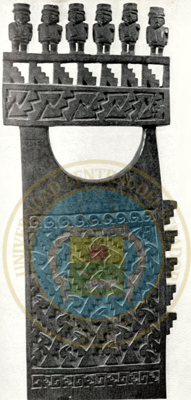
Detail of a Ceremonial Digging Implement of Mesquite Wood Ica Valley, Late Horizon 4-4663