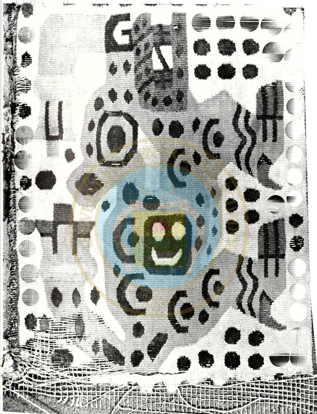
Tiahuanacoid Mythological Creature Fine Tapestry Bag from the Nasca Valley Middle Horizon 4-8786