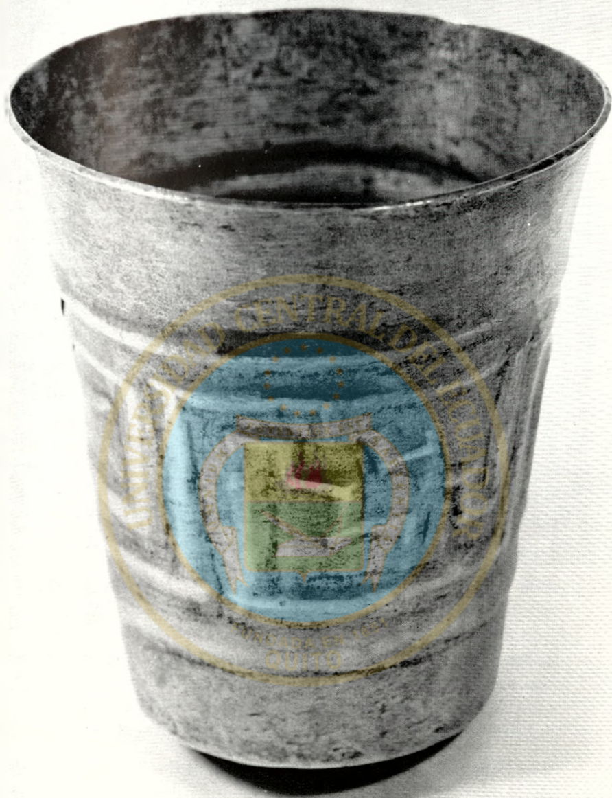
Silver Cup with Embossed Design, Ica Valley Late Intermediate Period 4-5272a