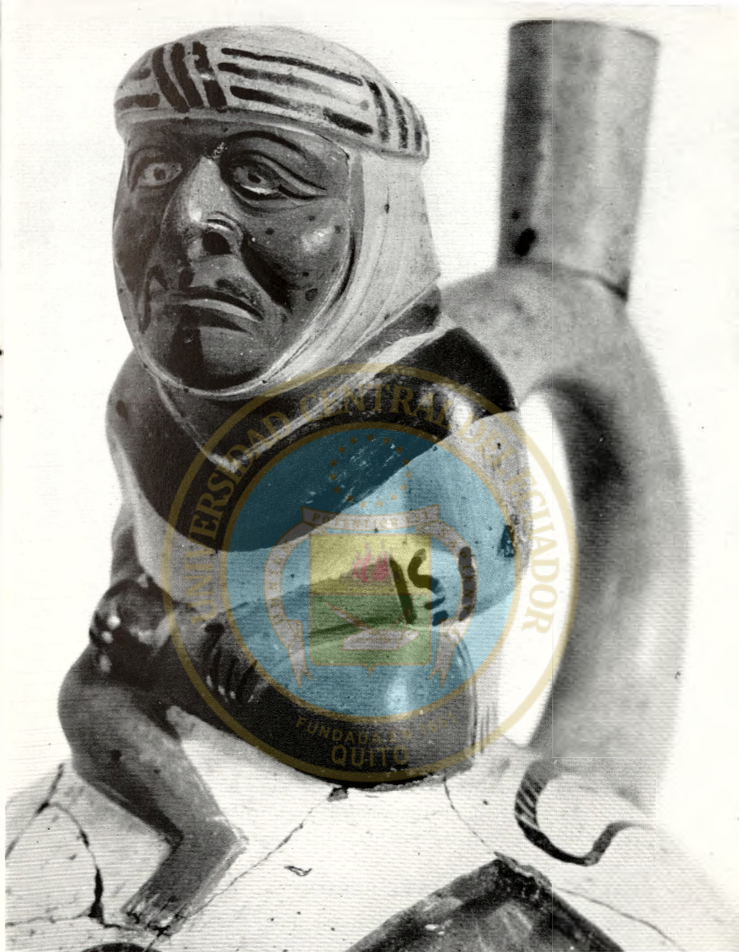
Amputee Pottery Bottle, from the Moche Valley, Moche Style Early Intermediate Period 4-2693