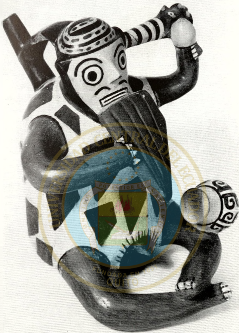
One-Man Band with Drum, Panpipe, Trumpet and Rattle Pottery Bottle, from the Nasca Valley, Monumental Nasca Style Early Intermediate Period 4-8481