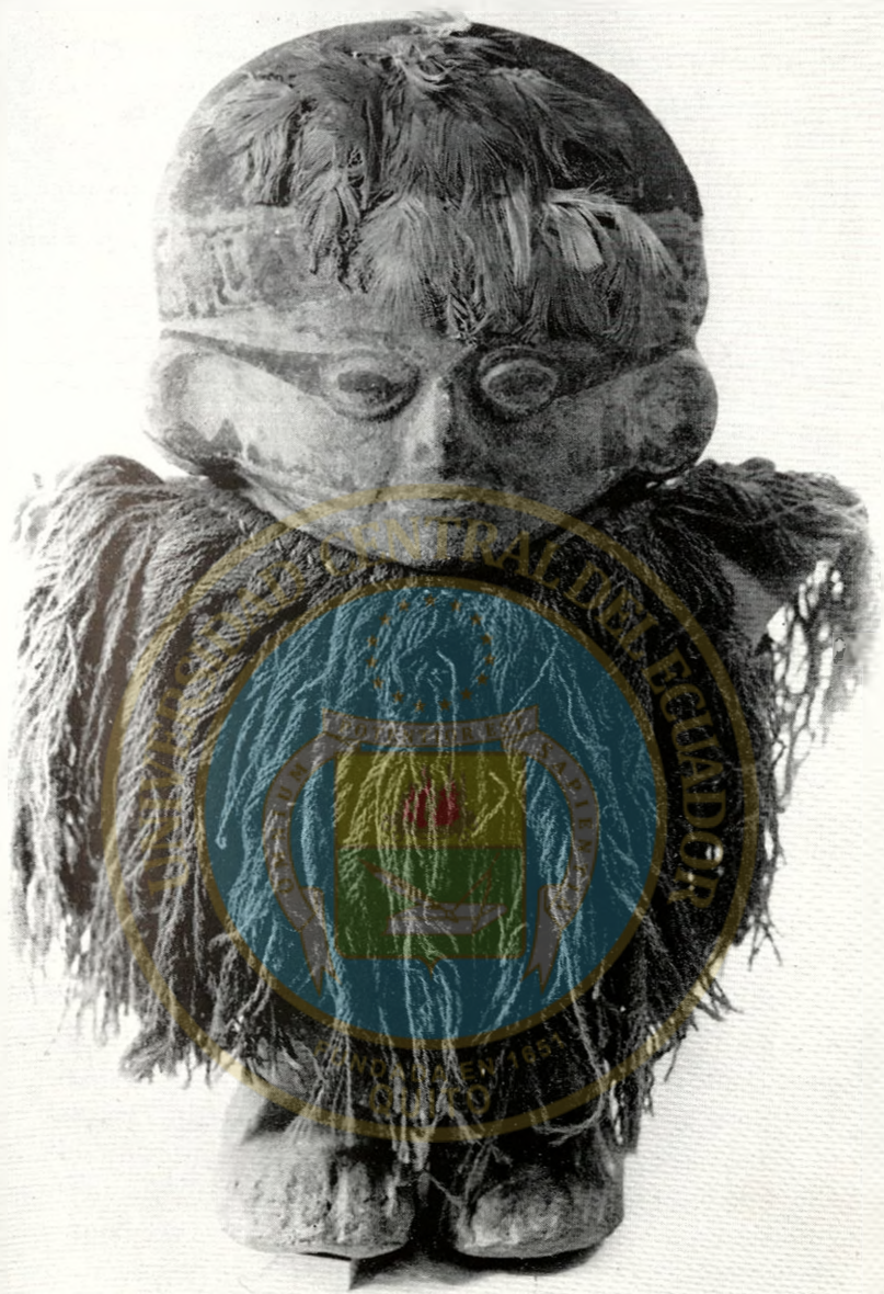
Pottery Doll with Feather Head Ornament and Fringed Dress, Chancay Valley Late Intermediate Period 16-1017