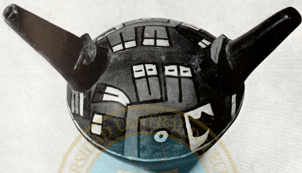
Mythological Bird Pottery Bottle from Supe, Pachacamac Style Middle Horizon 4-7742