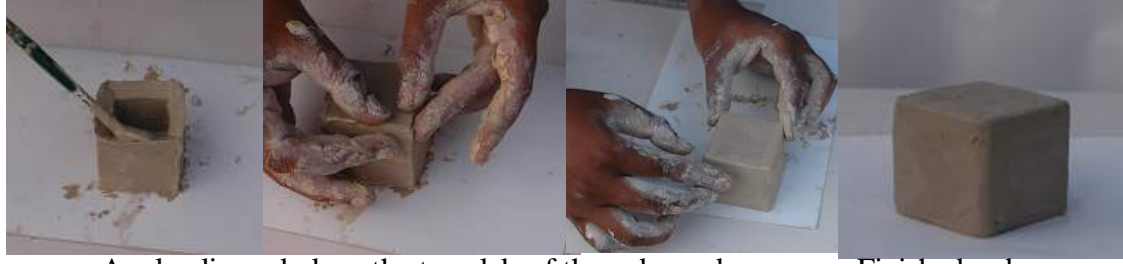
Apply slip and close the top slab of the cube and Smoothen the edges and give the finishing touches to the cube