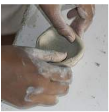
Finishing the rim of the bowl