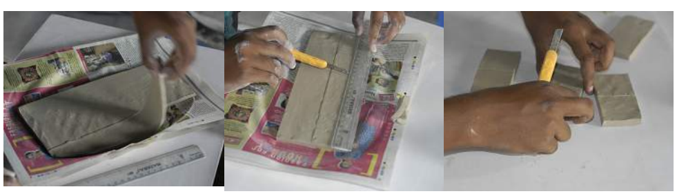
Remove the unwanted Parts of the slab