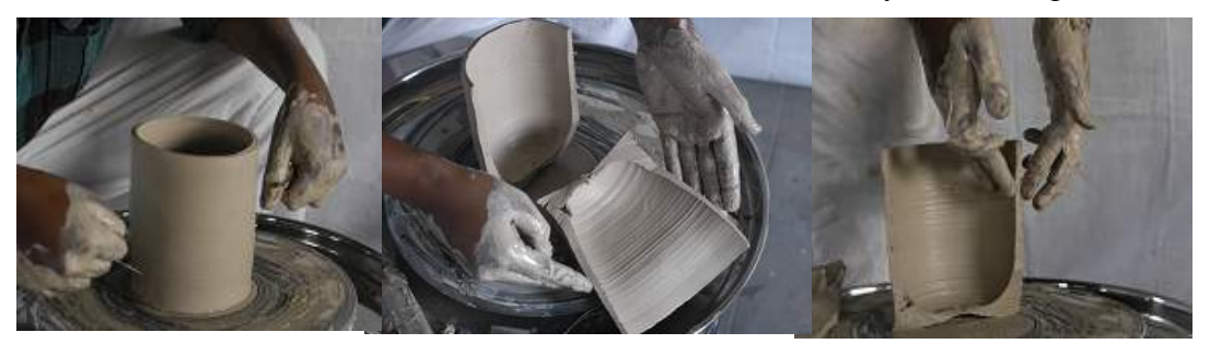
To check uniform Wall thickness while learning cut the cylinder vertical at the centre from the wheel base using wire tool