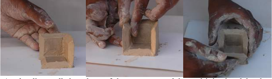
Apply slip to all the edges of the cut square slabs and join the slabs the Raise the walls of the cube