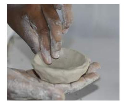
Finished bowl by pinching