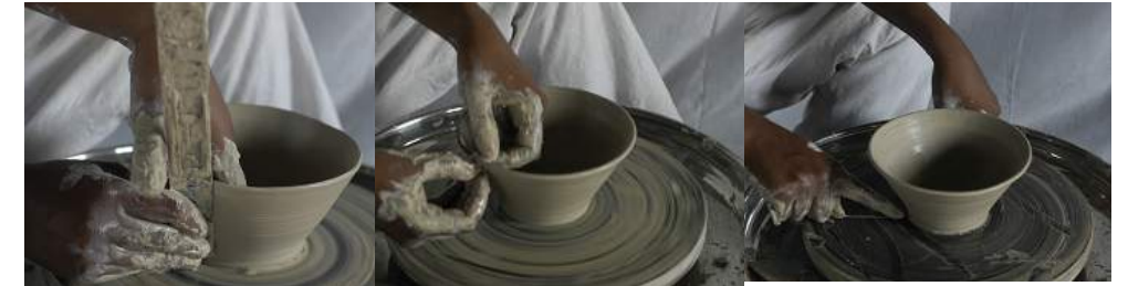
Finishing with ruler Finishing the rim Cut the finished bowl