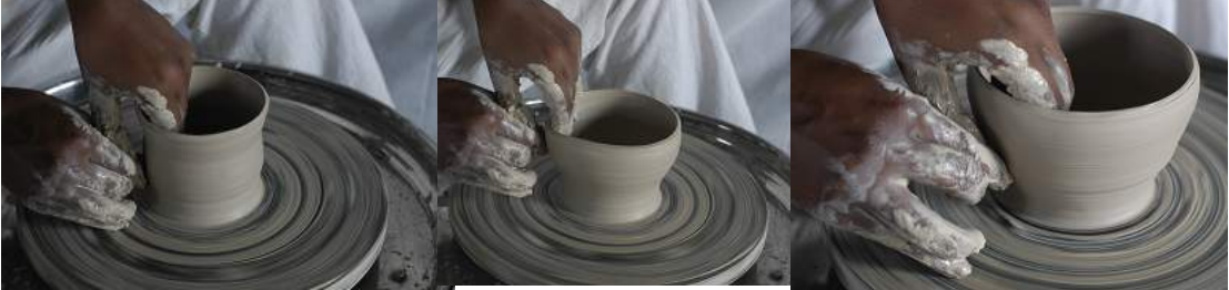
Lifting the bowl Pulling the bowl outwards Final lifting of bowl