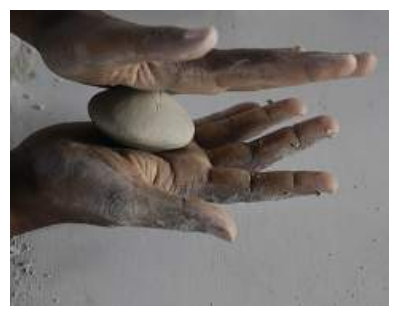
Begin with a ball of clay