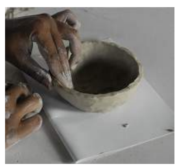
Bigger Bowl made by Pinch Pottery