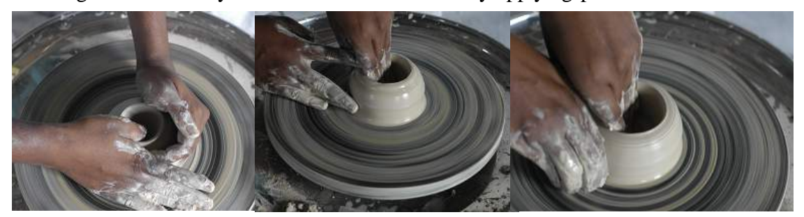
Opening with thumb finger Levelling the rim Levelling the wall