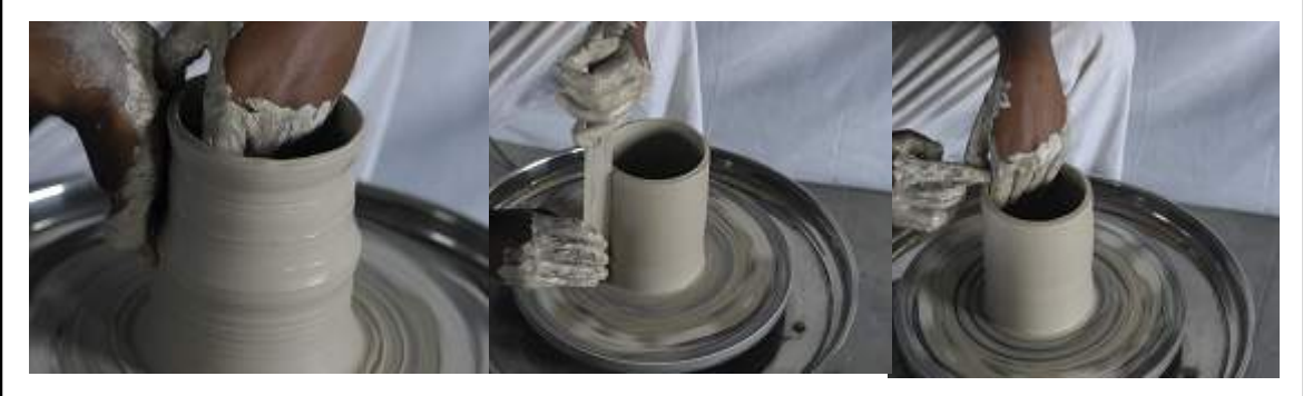
Lifting up the wall