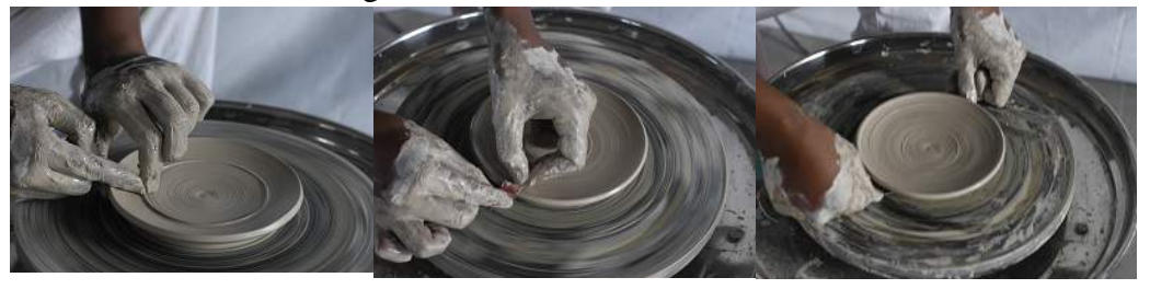
Finishing the top Surface of the saucer