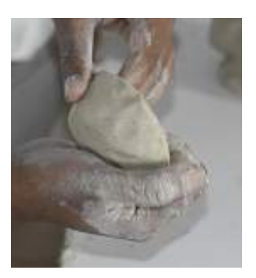
Gently pat the bottom on a flat surface to create a flat spot on the bottom of the piece.