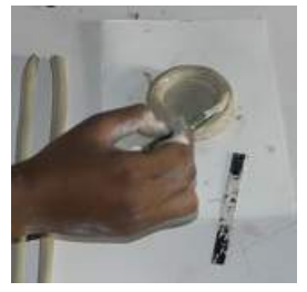
Apply slip-after each layer of coil