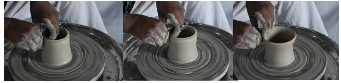
Lifting the wall of the cylinder pushing the top of the cylinder outwards