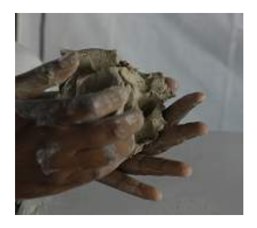
Preparation of clay