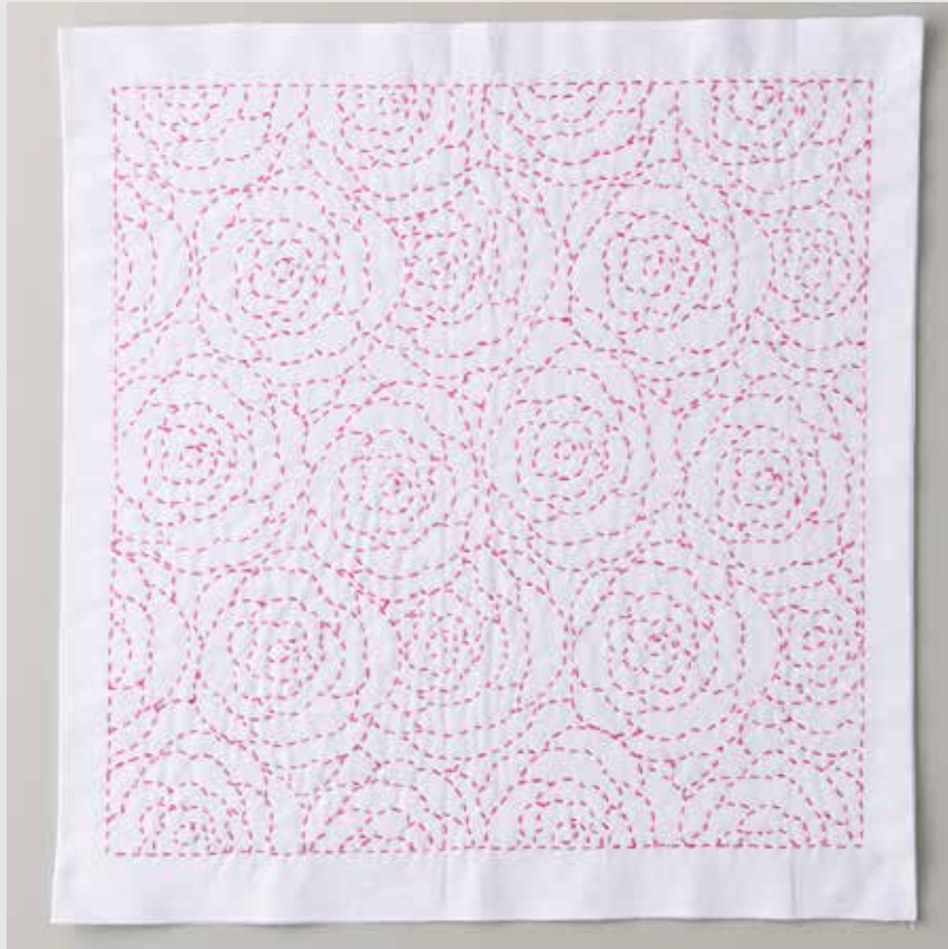
Finished size : Approx. 33 cm x 33 cm (square)